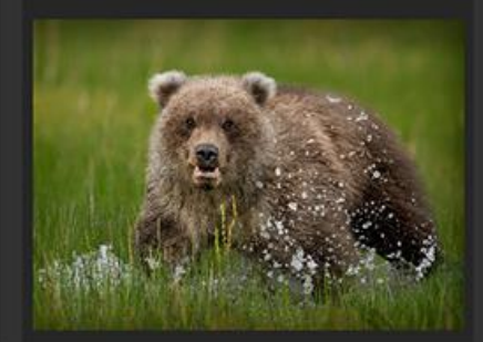
Alaskan Coastal Bear cub - Pamela Wilson.jpg