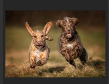
Double Trouble - Jennifer Wills.100