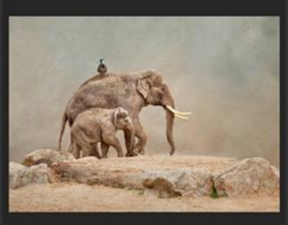
Hitching a Ride - Laurie Campbell.jpg