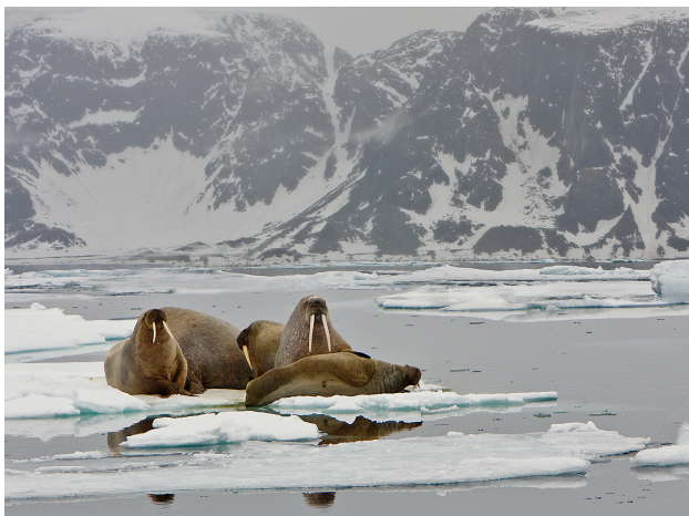
Best Enviromental Walrus on Ice Flow by Barrie Hatten