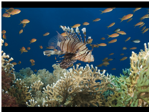
Best Underwater Lionfish & Anthiases