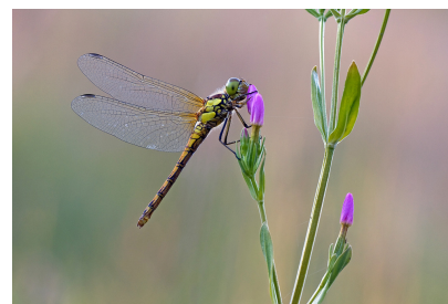
Common Darter (14)

Obviously thumbnails cannot fully convey the superb quality of the photographs.