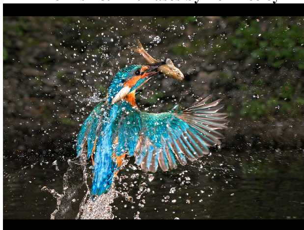
Best Bird Kingfisher with Fish