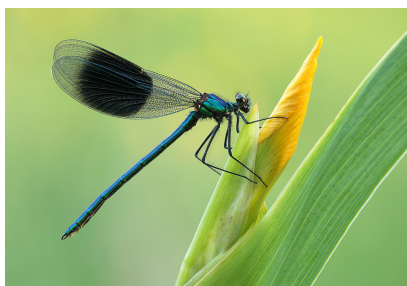
Banded Agrion on Flag (15)