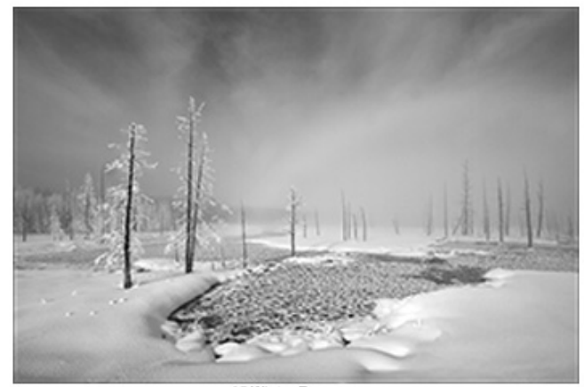
05 Winter Trees