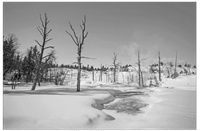
01 Winter in Yellowstone