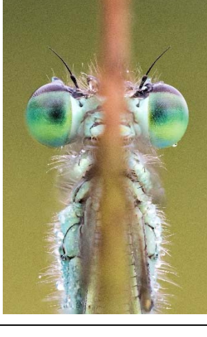
"Just Emerging" >> Gary's acceptance to the 2018 masters of print