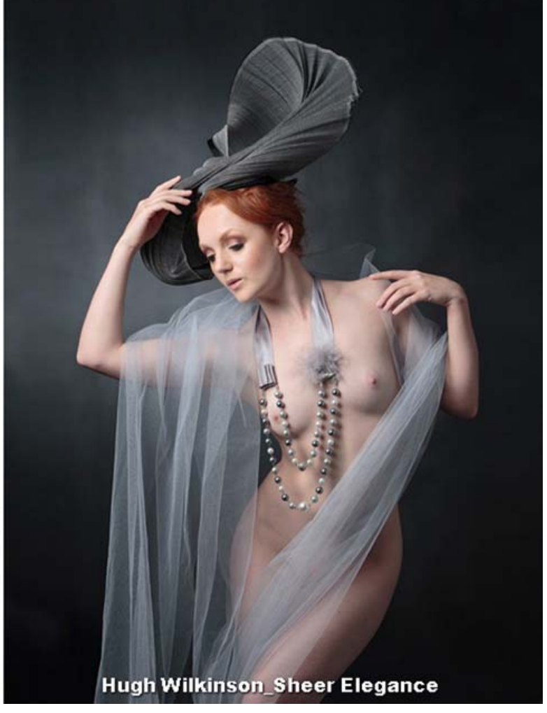
More pictures by Hugh on the next page >>