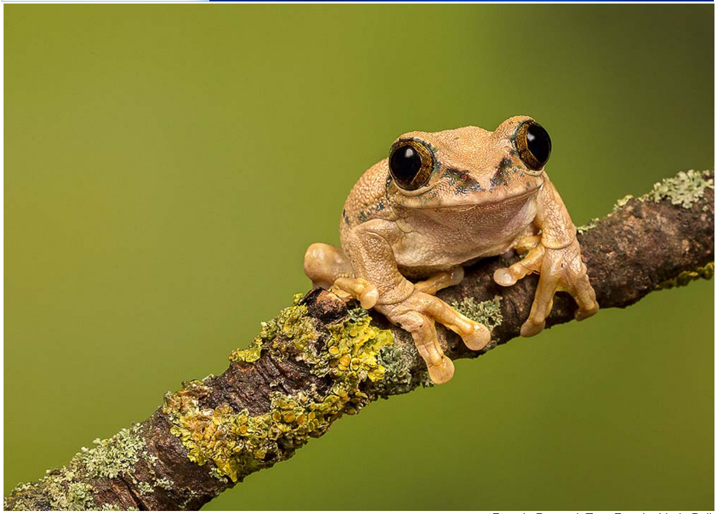
Female Peacock Tree Frog by Linda Bell