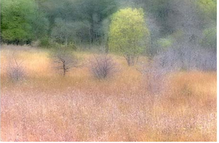
Marshland – again a dull day but with possibilities in the shapes and golden grasses. Blur layer to soften the scene, cloning the tree blocking the main tree, another blur layer and white layers.

On the day, I will show you will see full details of how I worked towards the final image and you will see the layers that I have used to effect the gradual transition.