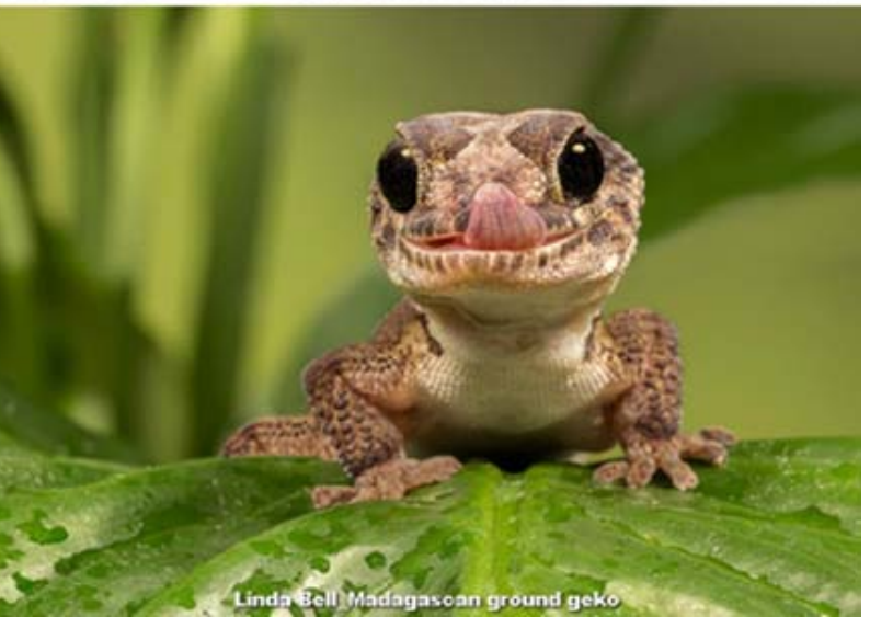
Page 7 of 15, e-news 226. 12 Mar 2019