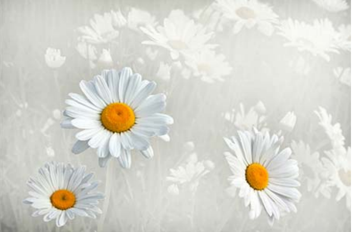
Daisies – shadows and highlights to lighten the dark areas, some cloning, masking the main flower heads and airbrushing the background. Reduced the greens with Hue and Saturation layer, then more airbrushing and white layers to finish.