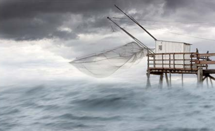
Fishing Hut - selective levels to bring out the hut. Selective white layers to keep the sky stormy, then add sea from another image to cover the grass, reduced opacity mono layer on the sea and two blur layers on the net to imply wind.