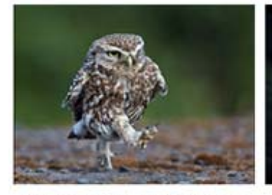
WIG11_Austin Thomas_Little Owl Walking.jpg