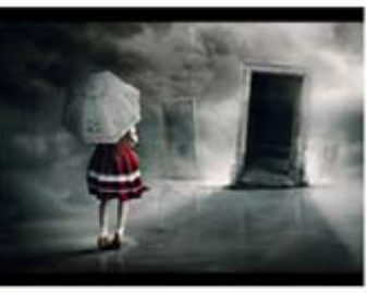
WIG12_KT Allen_No Coming Back.jpg