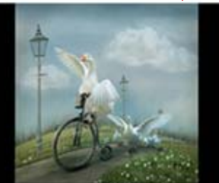
WIG2_Lyrine Morris_A Wild Goose Chase.jpg