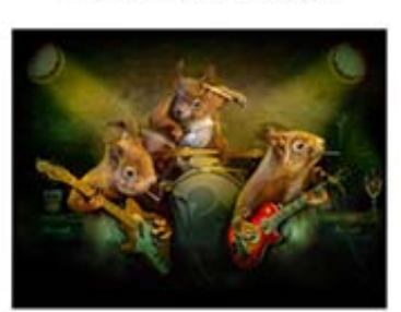
WIG29_Phil Barber_Squirrel Rock.jpg