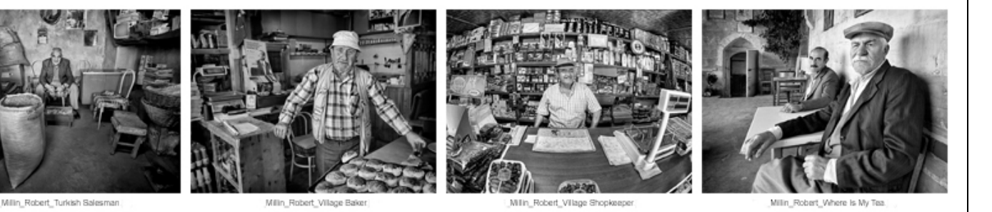
Click on the pictures to view them more comfortably on our website

Hon Editor: Rod Wheelans MPAGB MFIAP FIPF HonPAGB HonSPF. rod@creative-camera.co.uk