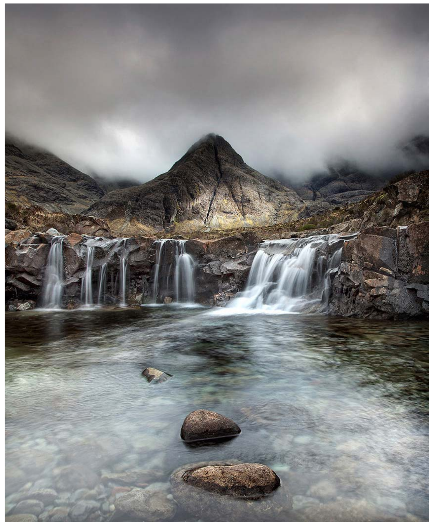
Fairy Pools by Les Forrester DPAGB