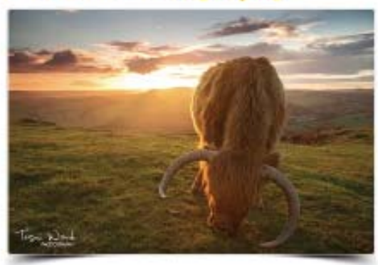
The Steps to Colour Accurate Printing: A Photographers Experience