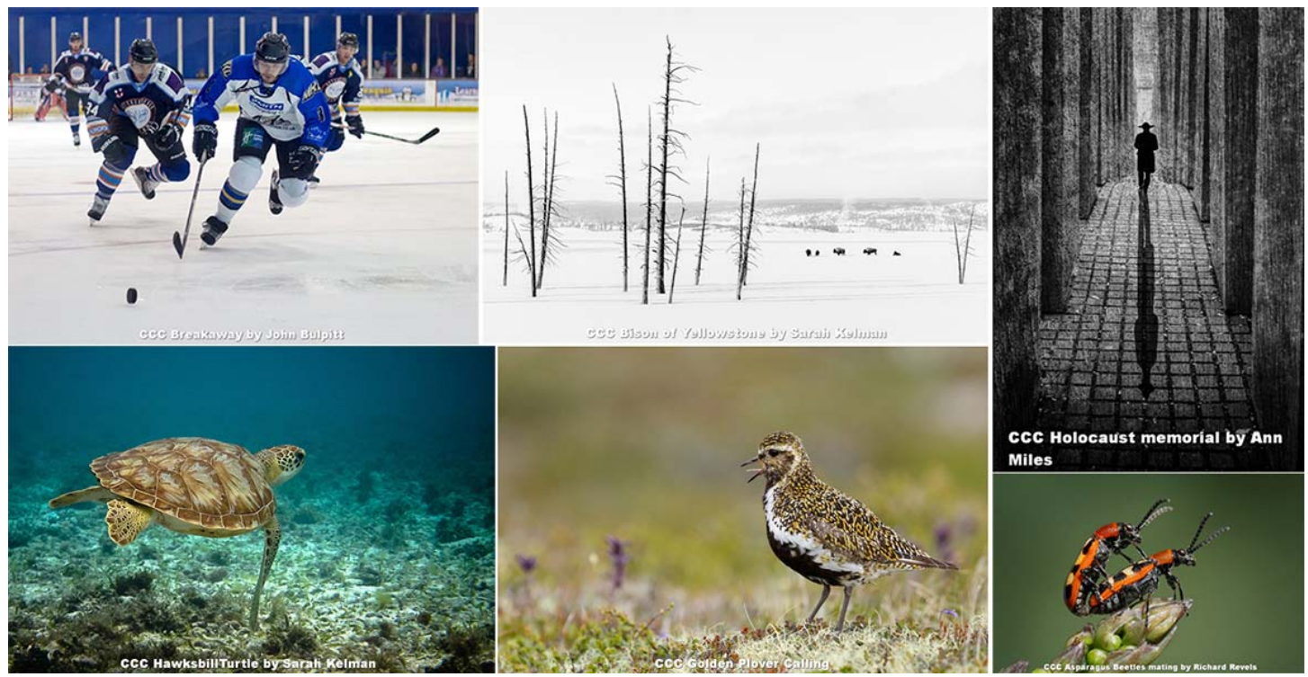
More pictures from the Cambridge C.C. Winning entry.