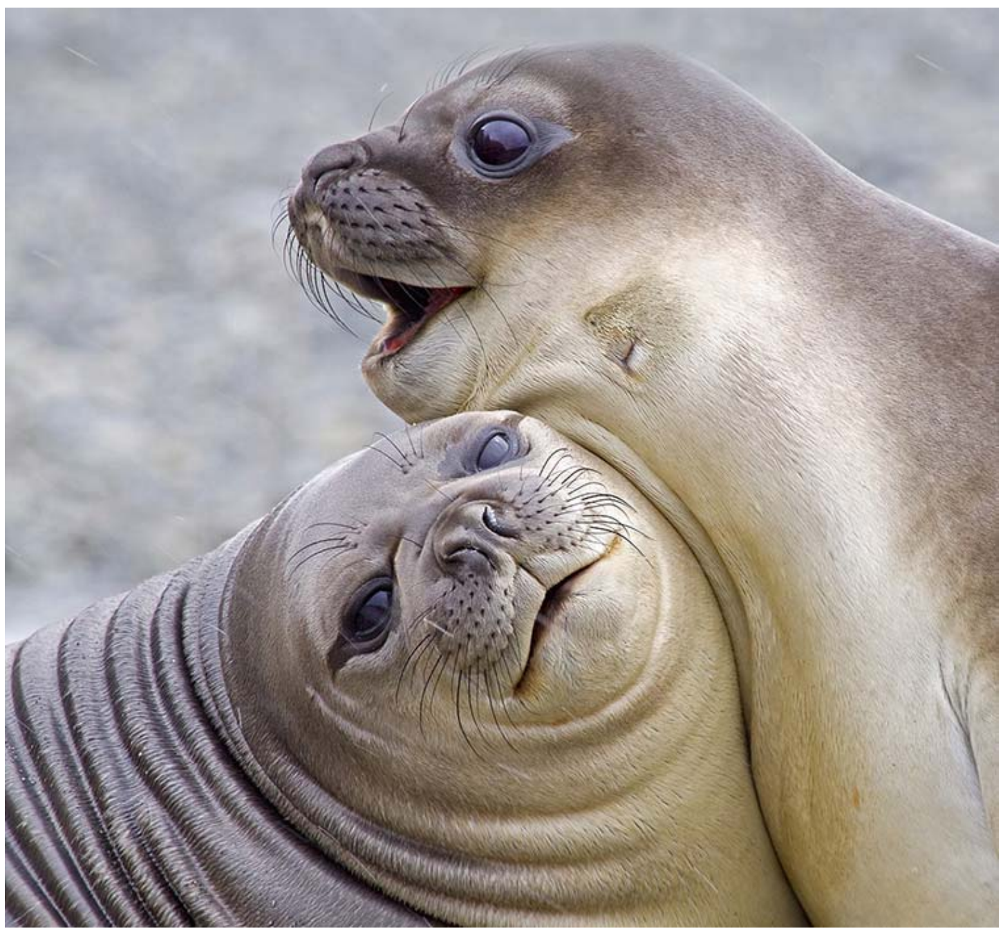
Elephant Seal Pups, Playfighting