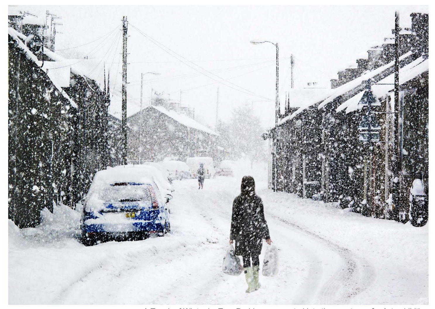
A Touch of Winter by Tom Dodd was accepted into the masters of print exhibition

The photo was taken in the main street of Blaenau Ffestiniog. I had walked into the town with my rucksack to top up with some food for a few days - impossible to get the car out. I had a Canon G10 with me, and this was the best snap on the way back. I tried to catch up with this lady a few times and loaded with a sack full of groceries; this was the closest I got and it all came together. I reckon she must have been quite fit. This of course is my kind of weather! The print was made on PermaJet FB Distinction paper using an Epson 3800 printer with PermaJet inks - a great combination.