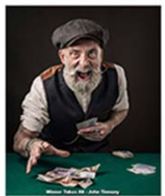
CLICK ON the pictures to view them larger on our website.