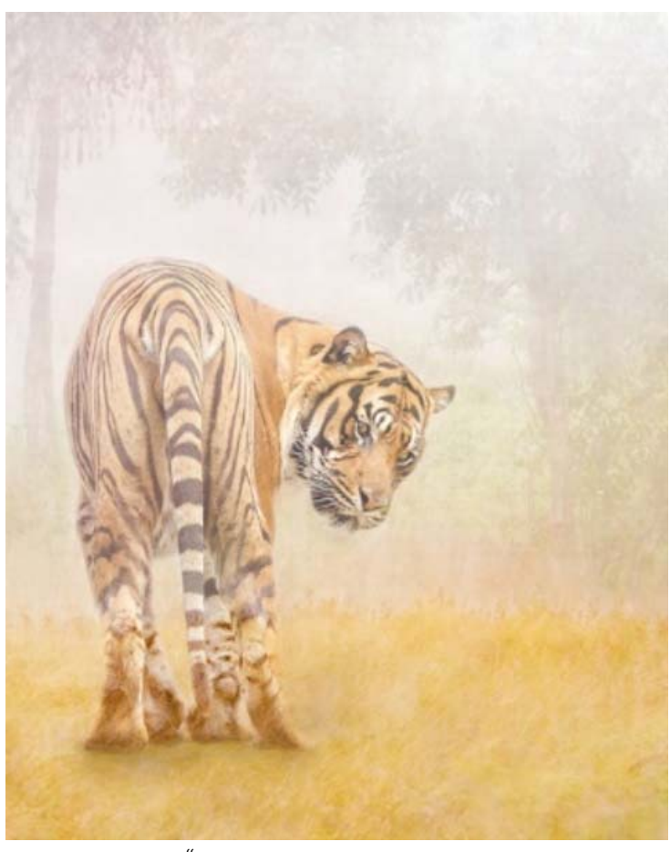
"Tiger"

It's a long way to Tipperary, that I do know For to the town of Thurles I did go Hoping those IPF judges they wouldn't say No Or I'd be drowning my sorrows in Pinot Grigio