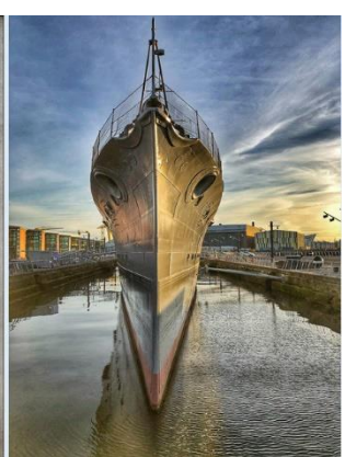
"Bad Hair Day" & "HMS Caroline" by Rod Wheelans