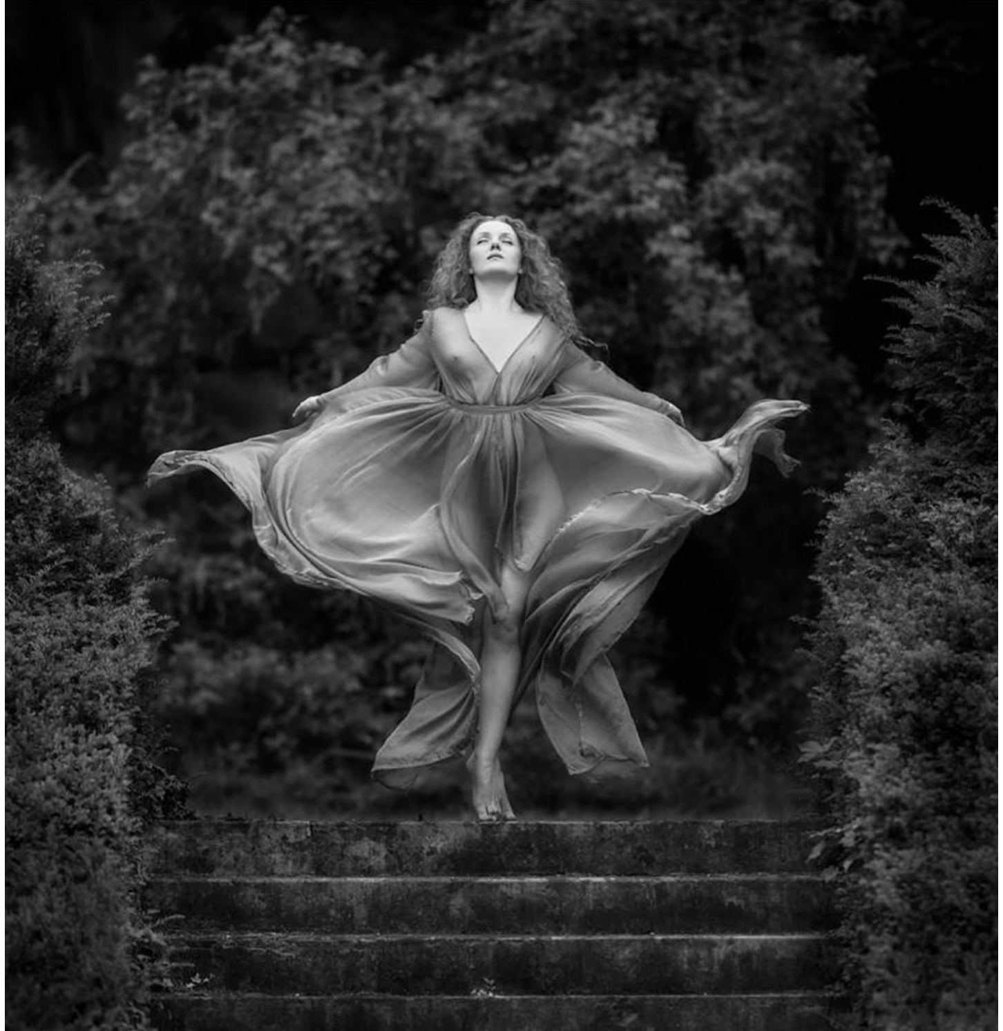
"A Strange Magic"