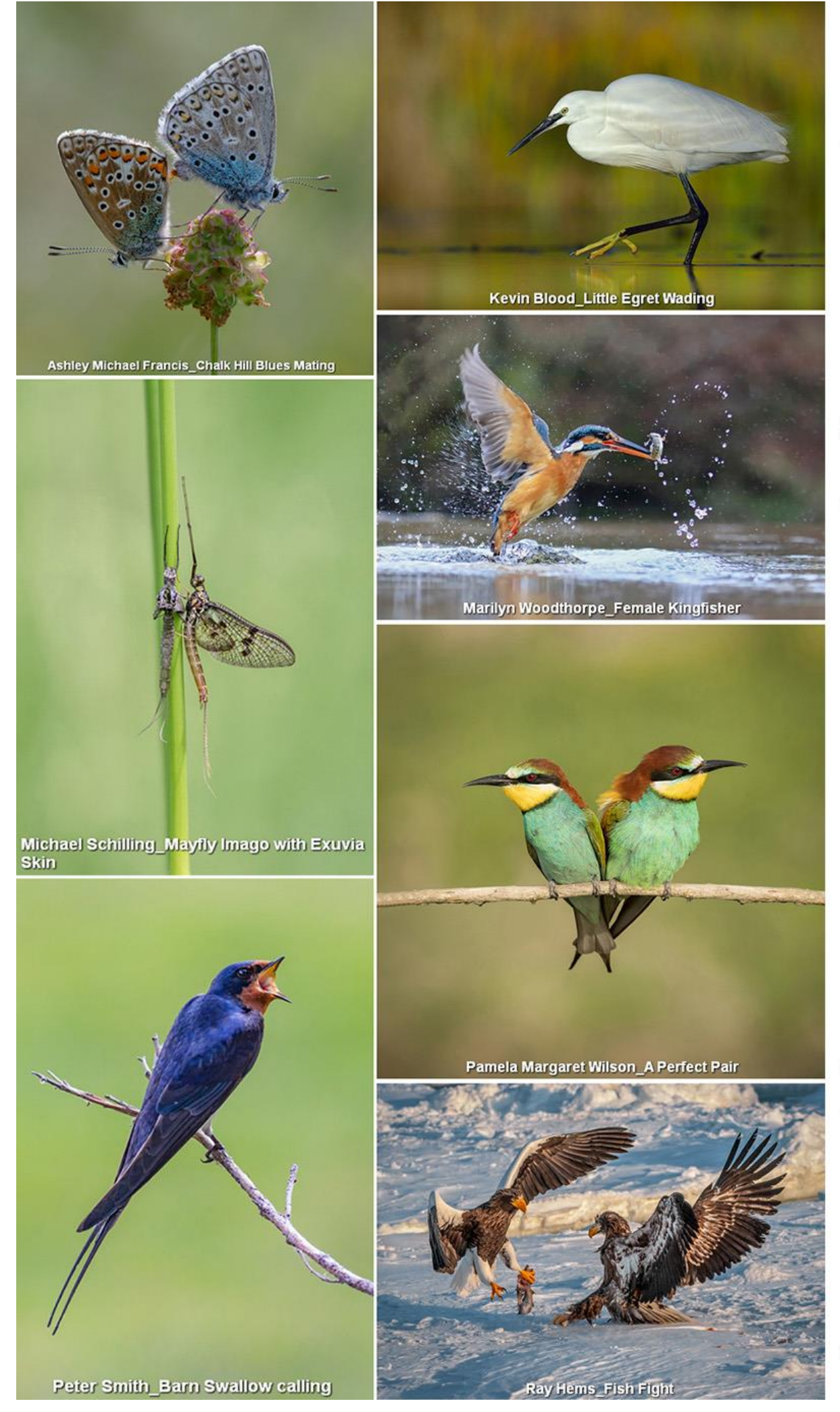
Page 2 of 12, e-news 240 17 Oct 2019

Approximately half of the submissions for the APM in recent years have been Nature Images. These pictures show how good you need to be to achieve the CPAGB. (Sept 2019 Dumfries).