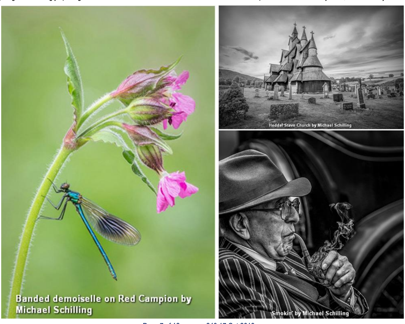
Page 7 of 12, e-news 240 17 Oct 2019