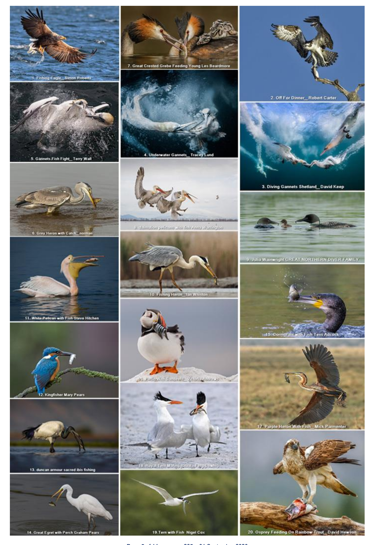
Page 5 of 14. e-news 265. 01 September 2020