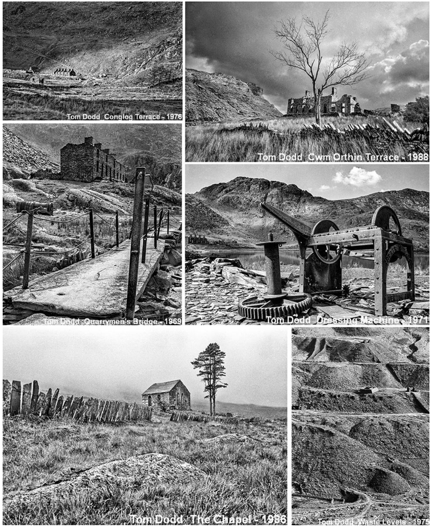
All of these photographs are scanned from B&W film.