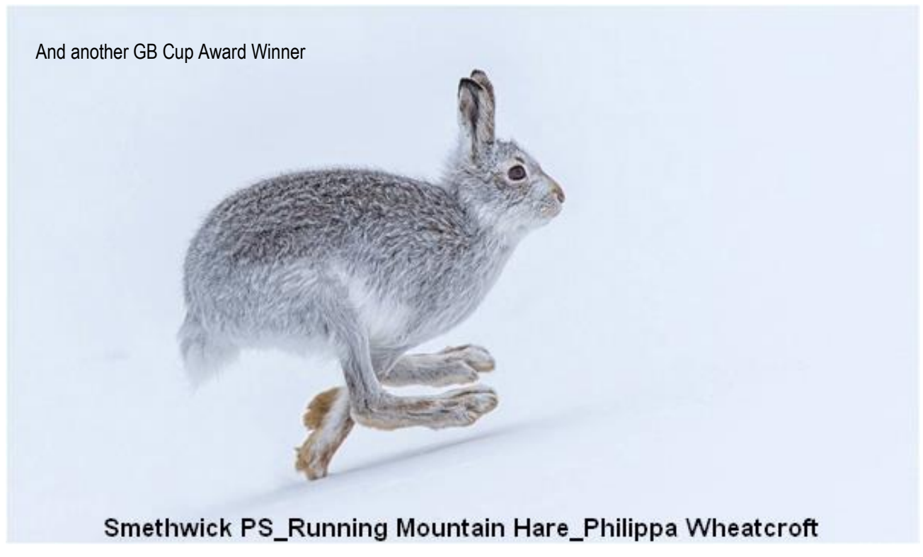
Page 4 of 16, e-news 303 19 Mar2022