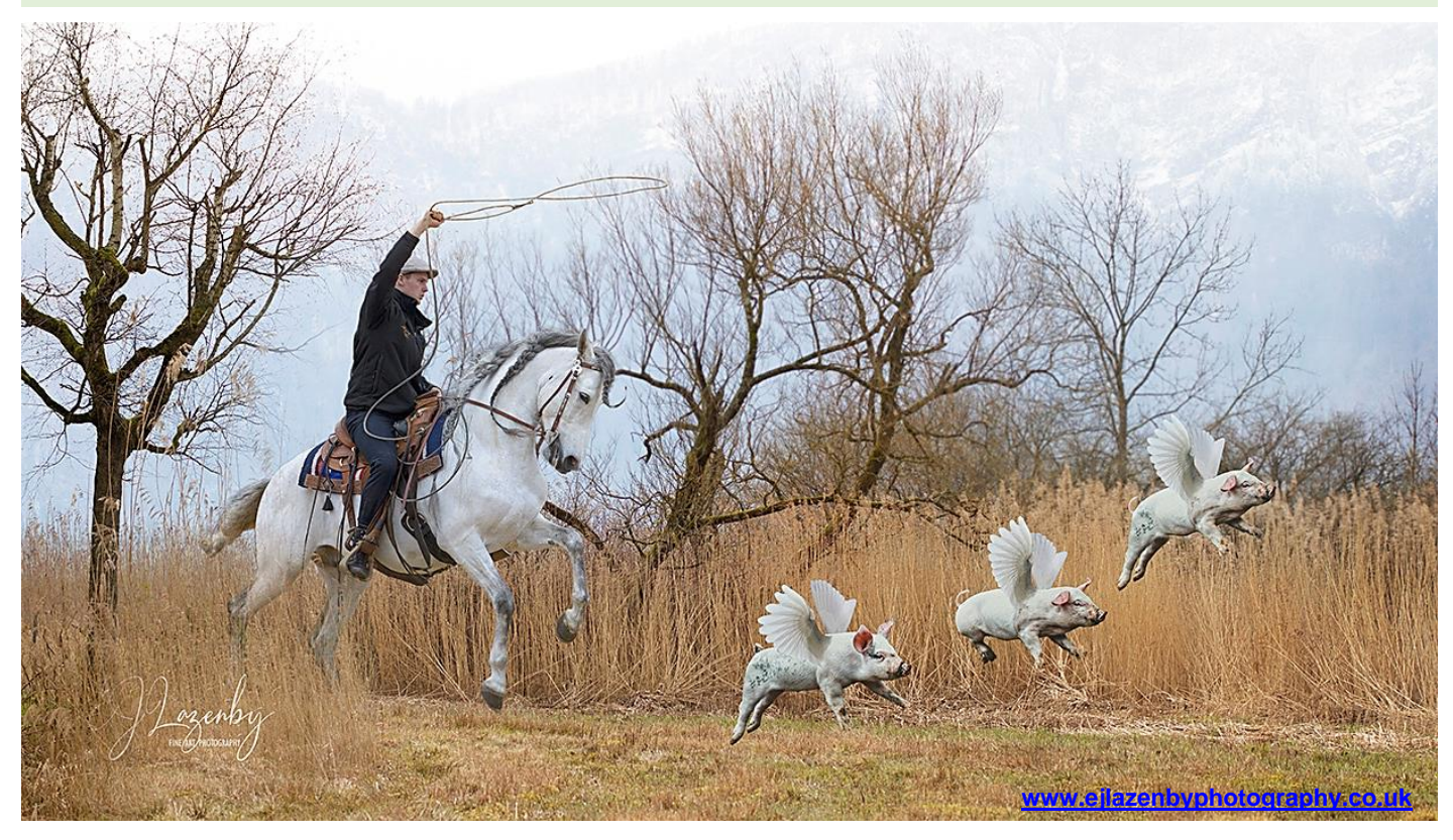
e-news 304, published on 1 April, received a healthy response from concerned readers.

In particular the article suggesting amendments to the criteria for entering Nature and Wildlife pictures to PAGB competitions in order to avoid images of violence or violent behaviour, generated several e-mails to your Editor and some heated debate on Social Media.