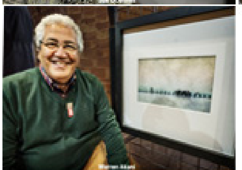
CLICK HERE If you missed the results >>