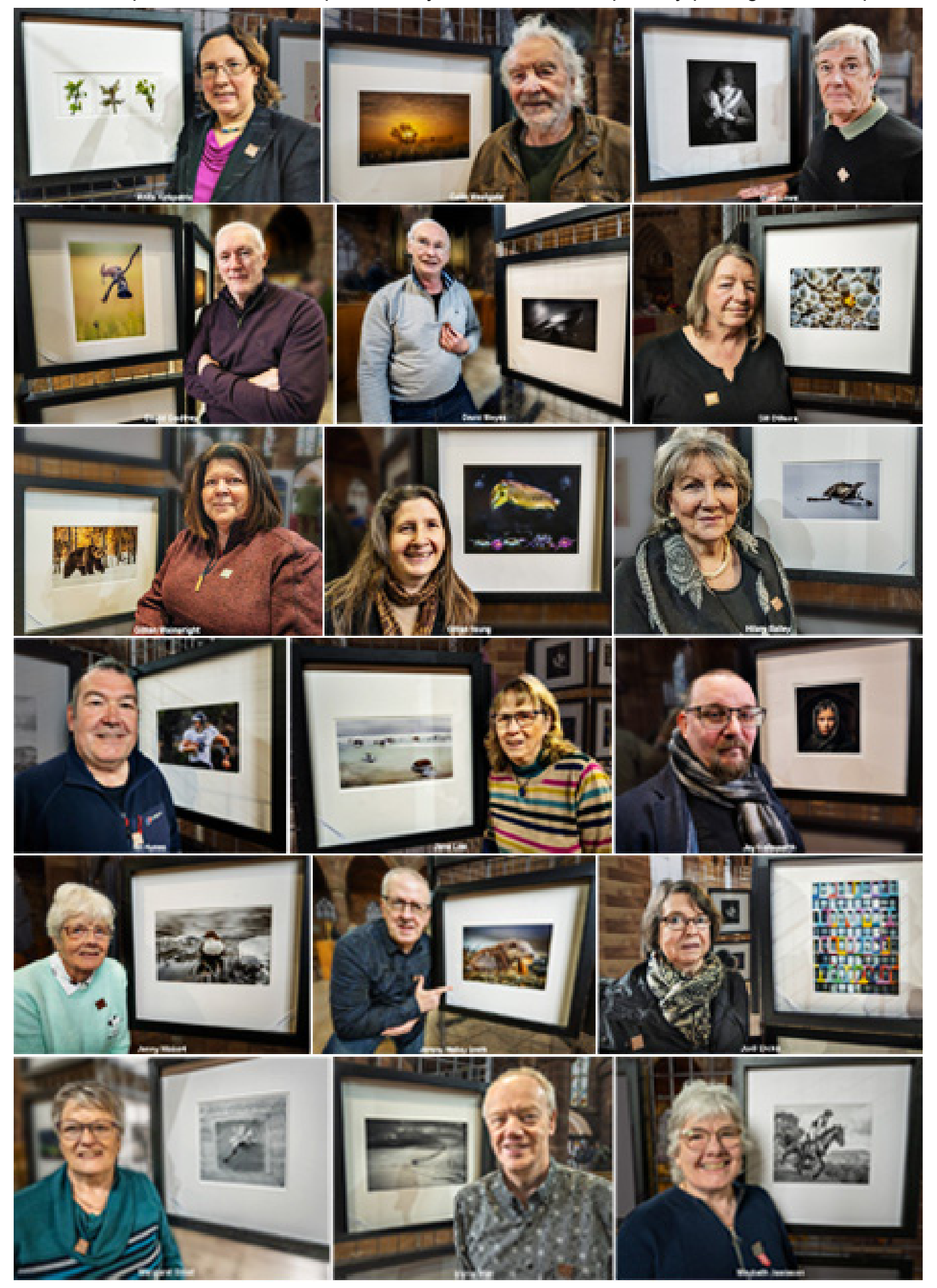
You can view these badge holders in their full glory on our website. CLICK ON any image. Bronze Badge for an Acceptance, Silver for Acceptance in 5 MoP exhibitions and Silver with Ribbon for more than 5 Acceptances.