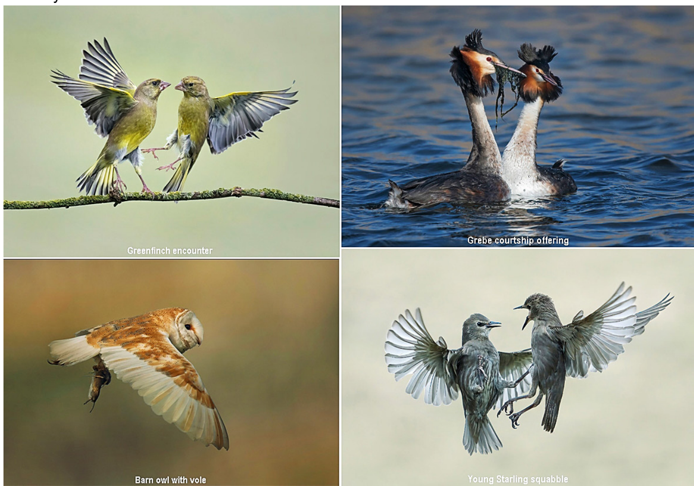
Page 15 of 15, e-news Issue 327. 01 March 2023