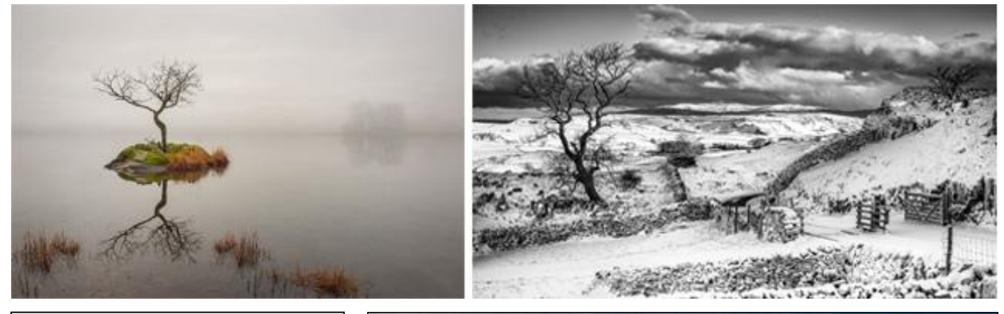
Above left. Second Place. Foggy morning on Rydal Water.

seeing the images that were submitted by photographers across the UK, celebrating all the beauty it beholds. It was really great to see so many different types of images and unique perspectives from the architecture of rural villages to nature throughout the seasons. We hope this competition has encouraged and inspired people to go out and experience the UK and share their beautiful photography."