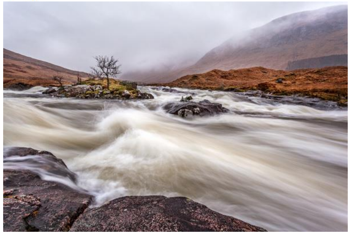
Storm Force Flow by Ian Pinn

I have been into photography for over 50 years. My last 10 years has mainly been landscape as I enjoy travelling and this gets me to some wonderful locations to shoot and record.