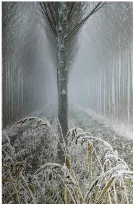
Poplars & Reeds, Irene Froy, Wrekin Arts PC