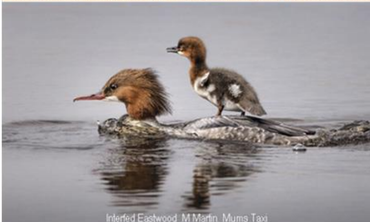
Interfed Eastwood_M Martin_Mums Taxi