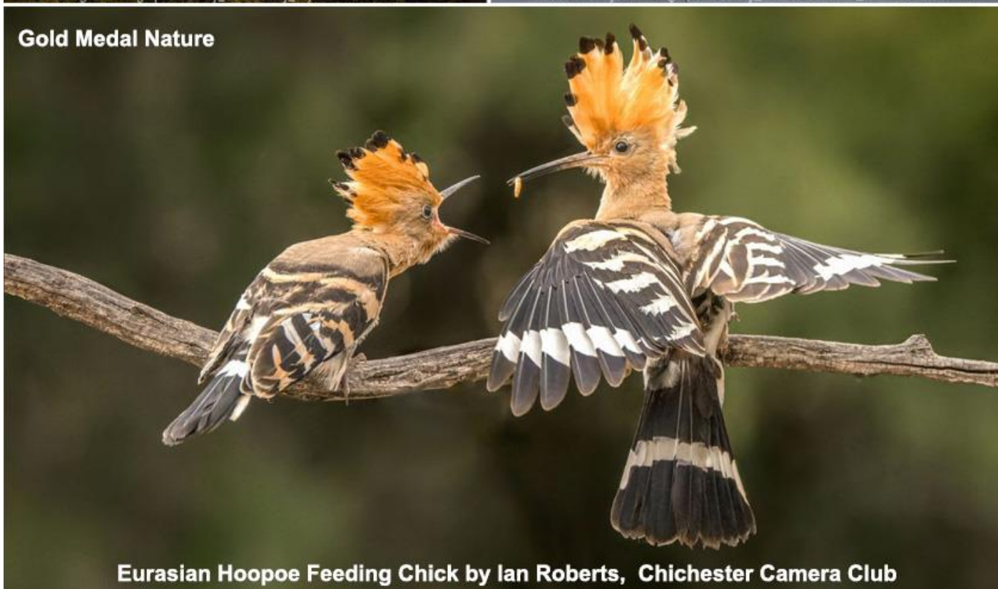
Eurasian Hoopoe Feeding Chick