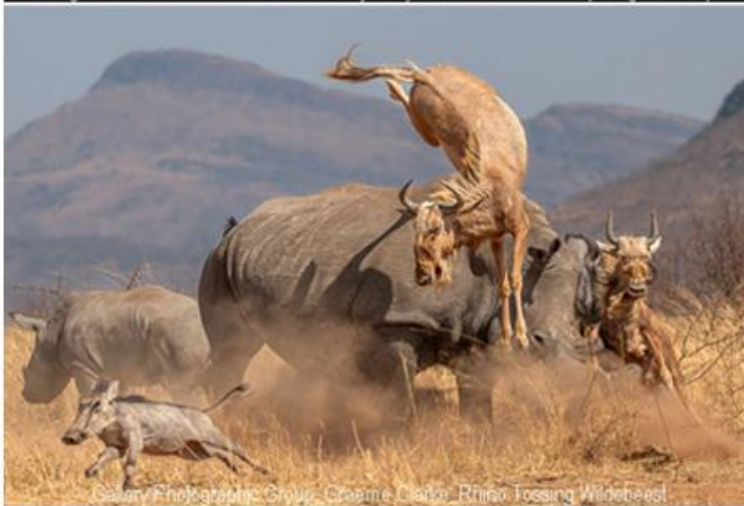
Rhino Tossing Wildebeest