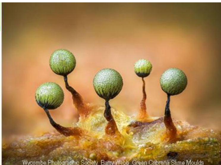
Wycombe Photographic Society_Barry Webb_Green Cribaria Slime Moulds