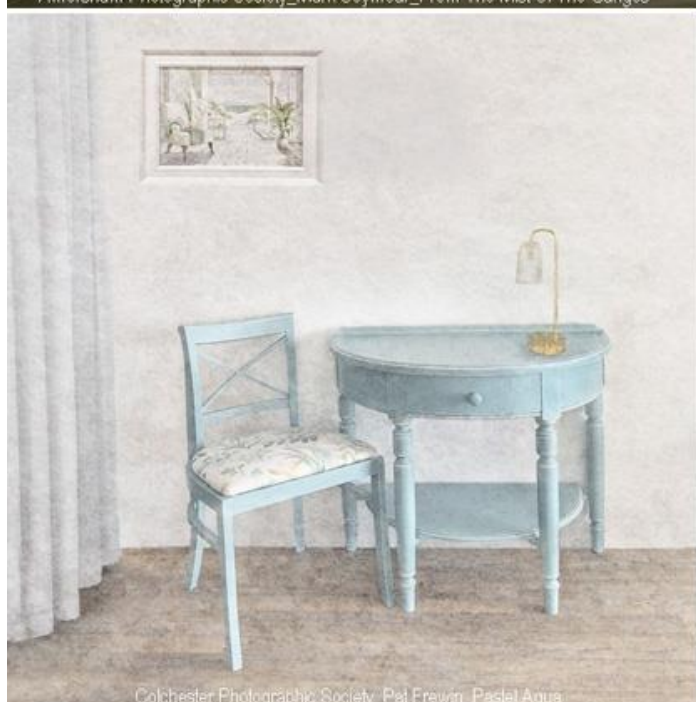
Colchester Photographic Society_Pat Frewin_Pastel Aqua