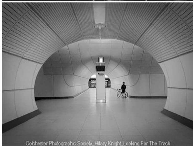
Colchester Photographic Society_Hilary Knight_Looking For The Track