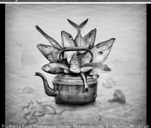
Poultton Le Fyde Photographic Society_Richard Omeara_A Different Kettle Of Fish

If you are logged in to our Central Management System