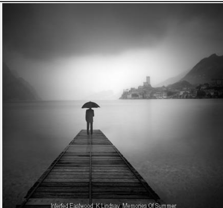
Interfed Eastwood_K Lindsay_Memories Of Summer