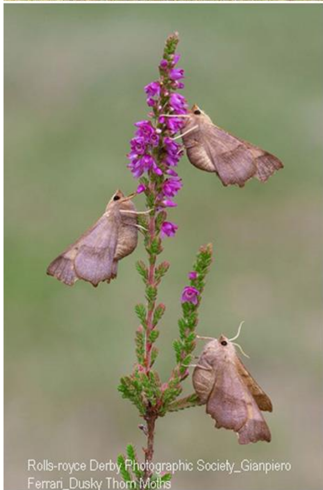
Dusky Thorn Moths