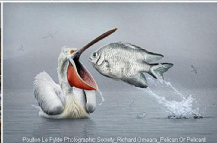
Poullon Le Fylde Photographic Society_Richard Omeara_Pelican Or Pelican!