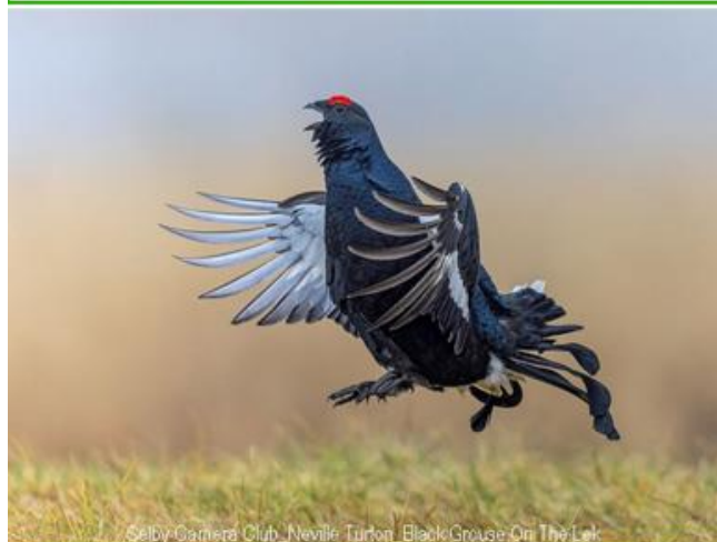
Selby Camera Club_Neville Tutton_Black Grouse On The Lek