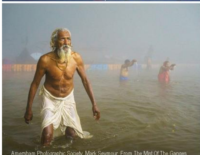
Amersham Photographic Society_Mark Seymour_From The Mist Of The Ganges