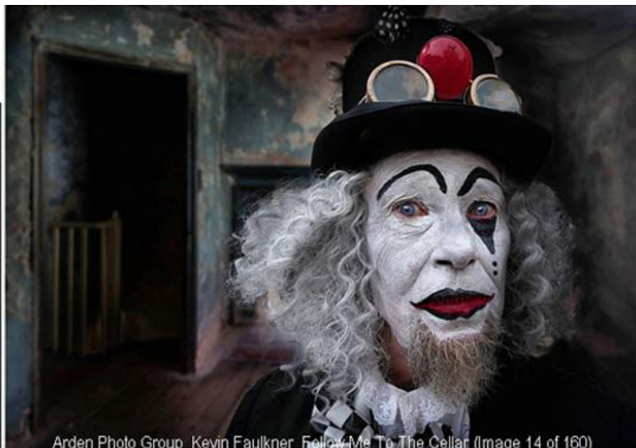
Arden Photo Group_Kevin Faulkner_Follow Me To The Cellar (Image 14 of 160)