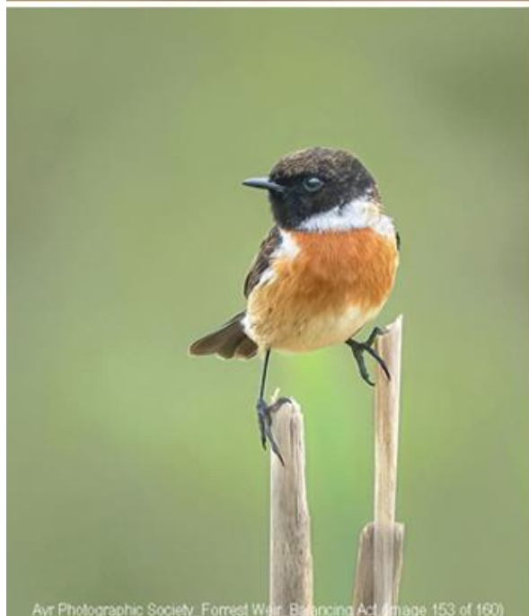
Ayr Photographic Society_Forrester Weir_Balancing Act (Image 153 of 160)