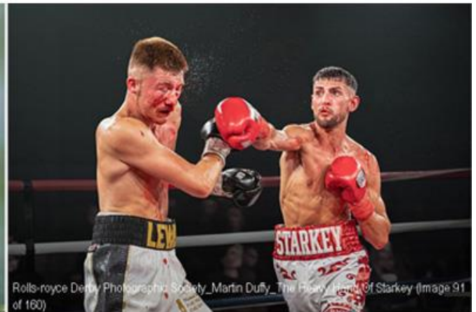
Rolls-royce Derby Photographic Society_Martin Duffy_The Heavy Hand Of Starkey (Image 91 of 160)