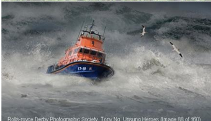
Rolls-royce Derby Photographic Society_Tony Ng_Unsung Heroes (Image 88 of 160)