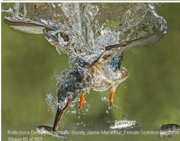
Rolls-royce Derby Photographic Society_Jamie Macarthur_Female Common Kingfisher (Image 66 of 160)