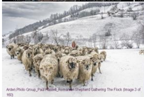
Arden Photo Group_Paul Hassell_Remains Shepherd Gathering The Flock (Image 3 of 160)