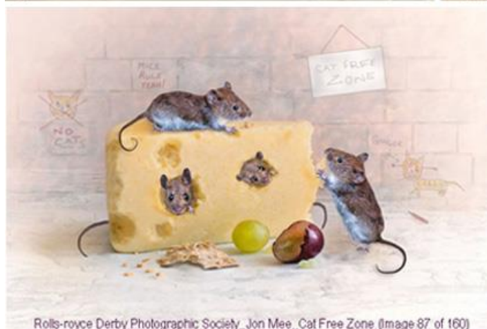
Rolls-royce Derby Photographic Society_Jon Mee_Cat Free Zone (Image 87 of 160)