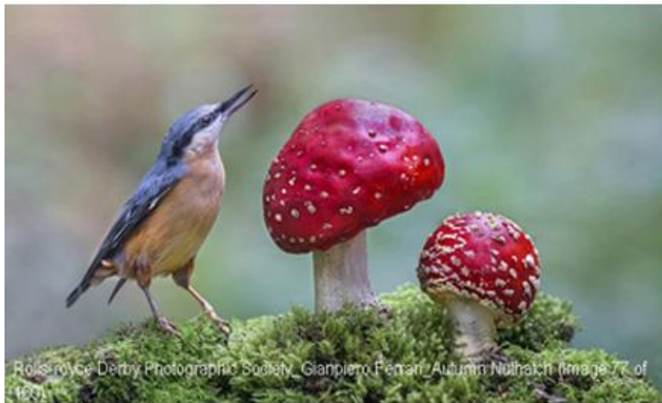
Rolls-royce Derby Photographic Society_Gianpietro Pedroni_Autumn Nuthatch (Image 77 of 160)