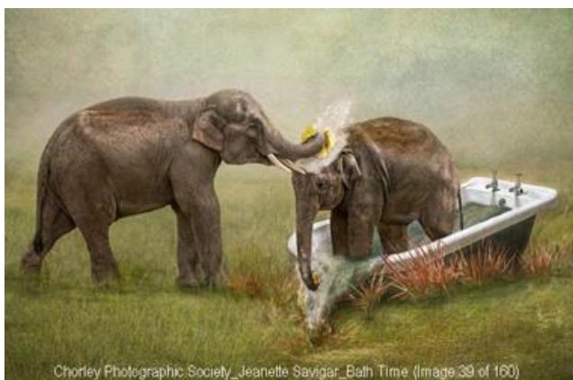
Chorley Photographic Society_Jeanette Savigar_Bath Time (Image 39 of 160)

CLICK ON any image to view it more comfortably on our e-news website.