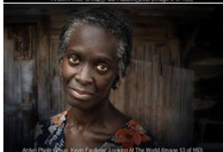
Arden Photo Group_Kevin Faulkner_Looking At The World (Image 13 of 160)