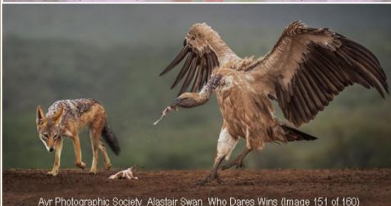
Ayr Photographic Society_Alastair Swan_Who Dares Wins (Image 151 of 160)