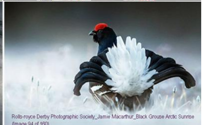
Rolls-royce Derby Photographic Society_Jamie Macarthur_Black Grouse Arctic Sunrise (Image 94 of 160)