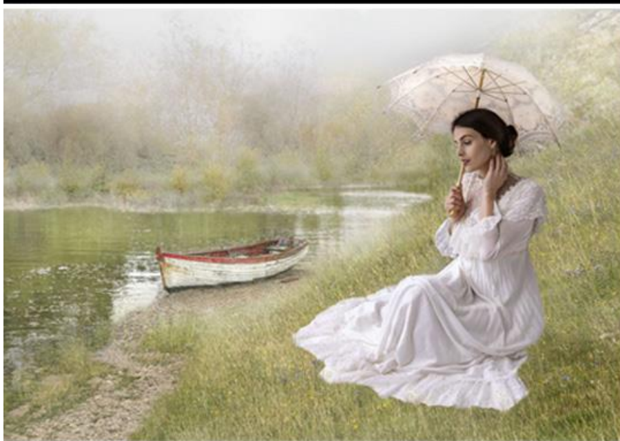
'By The Riverside' by Jon Mee of Rolls-Royce Derby Photographic Society (NEMPF ) Inter-Club PDI Championship - Final 2025