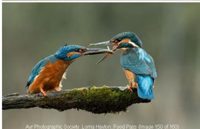
Ayr Photographic Society_Loma Hayton_Food Pass (Image 150 of 160)