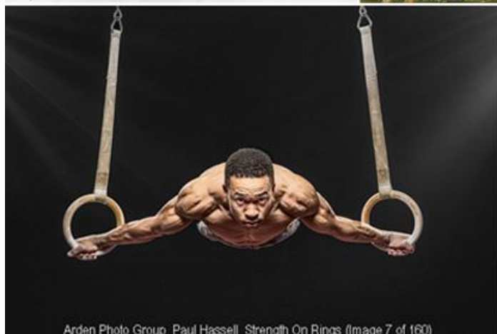
Arden Photo Group_Paul Hassell_Strength On Rings (Image 7 of 160)