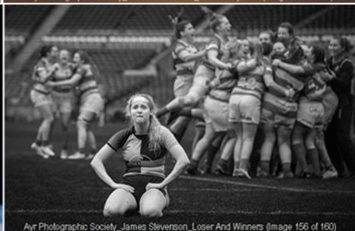
Ayr Photographic Society_James Stevenson_Loser And Winners (Image 156 of 160)