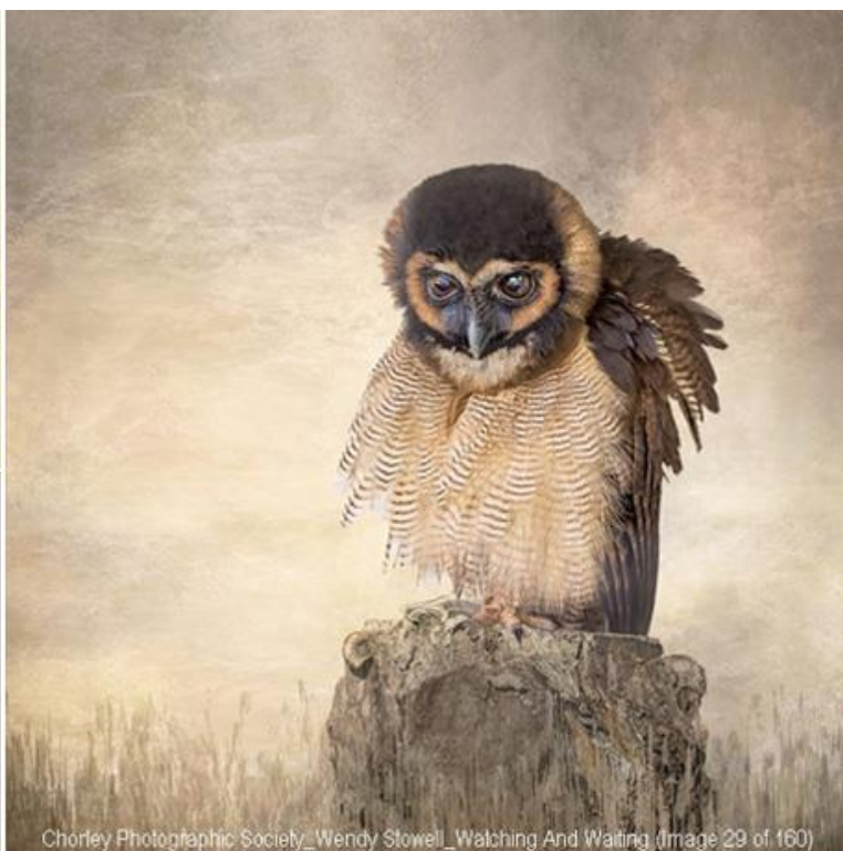
Chorley Photographic Society_Wendy Stowell_Watching And Waiting (Image 29 of 160)