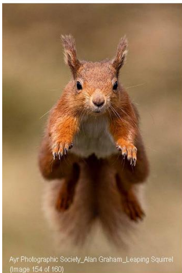
Ayr Photographic Society_Alan Graham_Leaping Squirrel (Image 154 of 160)