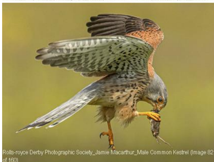
Rolls-royce Derby Photographic Society_Jamie Macarthur_Male Common Kestrel (Image 82 of 160)