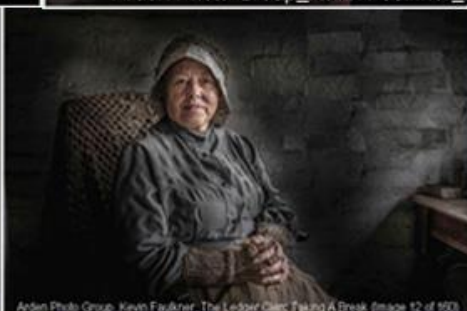
Arden Photo Group_Kevin Faulkner_The Ledger Clerk Taking A Break (Image 12 of 160)