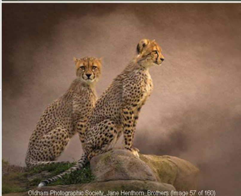
Oldham Photographic Society_Jane Henthorn_Brothers (Image 57 of 160)

CLICK ON any image to view Oldam's entire entry