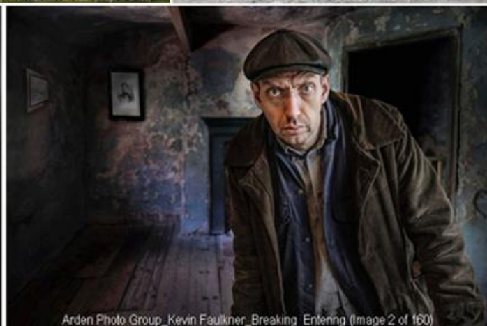
Arden Photo Group_Kevin Faulkner_Breaking Entering (Image 2 of 160)

CLICK ON any image to view the entire Arden entry on our website