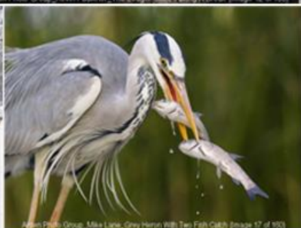
Grey Heron With Two Fish Catch (Image 17 of 160)