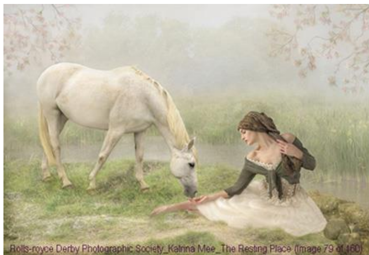
Rolls-royce Derby Photographic Society_Katrina Mee_The Resting Place (Image 79 of 160)