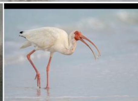
Chorley Photographic Society, Gillian Moon, White Ibis Tossing Fish (Image 54 of 160)