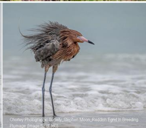
Chorley Photographic Society, Stephen Moon, Reddish Egret In Breeding Plumage (Image 52 of 160)