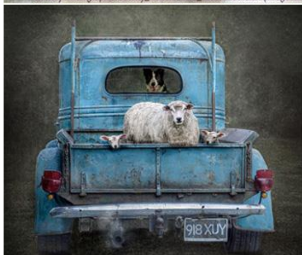
Chorley Photographic Society_Jeanette Savigar_Were On The Move Again Kids (Image 40 of 160)