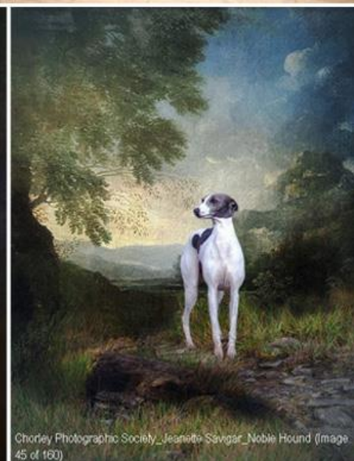
Chorley Photographic Society_Jeanette Savigar_Noble Hound (Image 45 of 160)