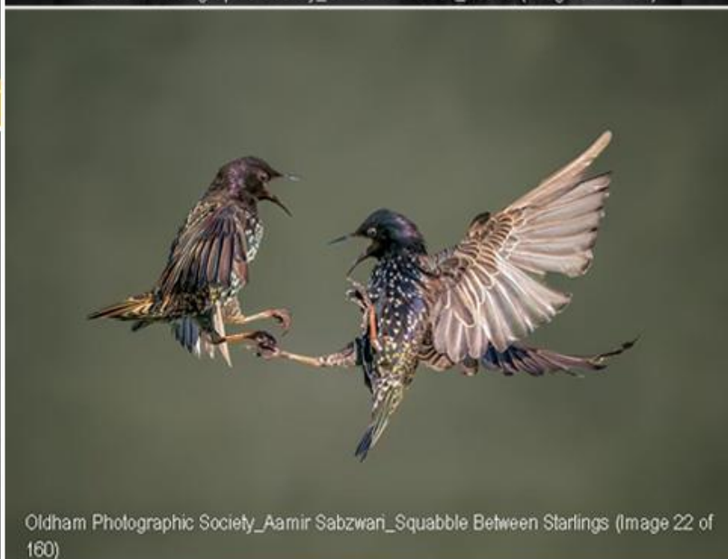
Oldham Photographic Society_Aamir Sabzwari_Squabble Between Starlings (Image 22 of 160)