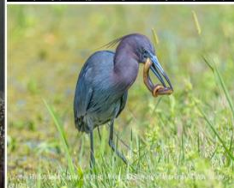
Chorley Photographic Society, Gillian Moon, Blue Heron With Fish (Image 53 of 160)