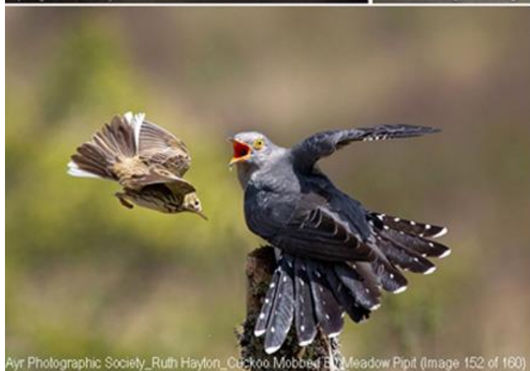
Ayr Photographic Society_Ruth Hayton_Cuckoo Mobbed By Meadow Pipit (Image 152 of 160)