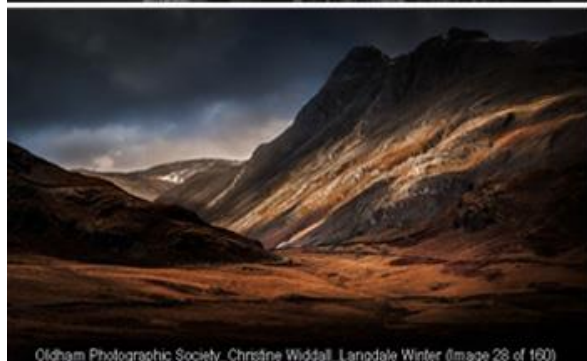
Oldham Photographic Society_Christine Widdall_Langdale Winter (Image 28 of 160)