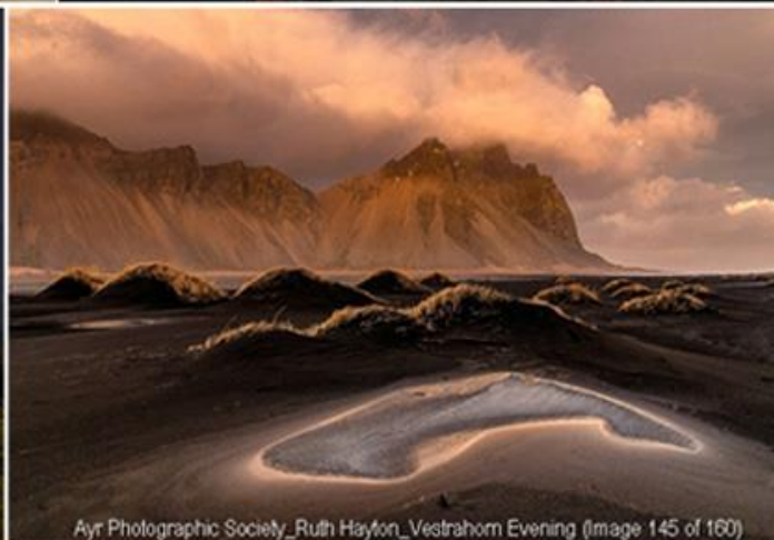
Ayr Photographic Society_Ruth Hayton_Vestrahorn Evening (Image 145 of 160)

Don't forget to visit our website gallery