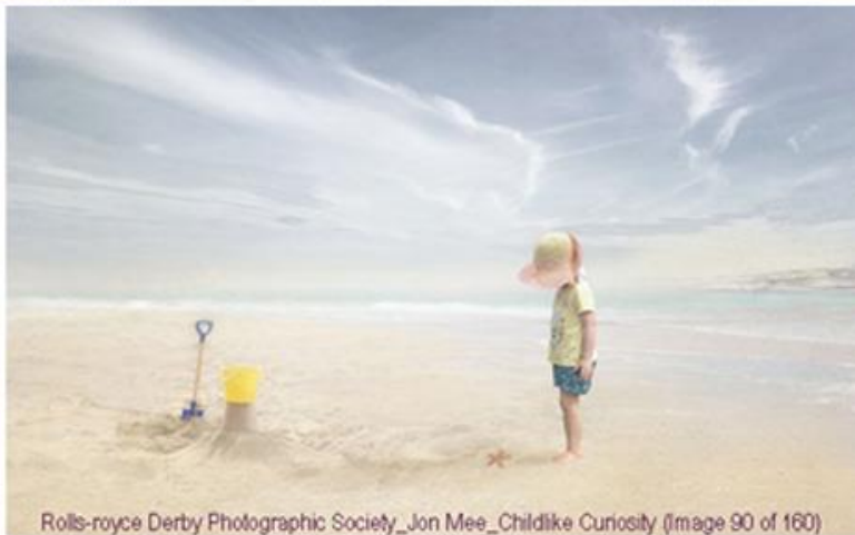
Rolls-royce Derby Photographic Society_Jon Mee_Childlike Curiosity (Image 90 of 160)