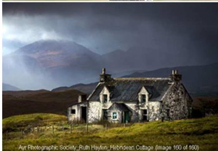
Ayr Photographic Society_Ruth Hayton_Hebridean Cottage (Image 160 of 160)