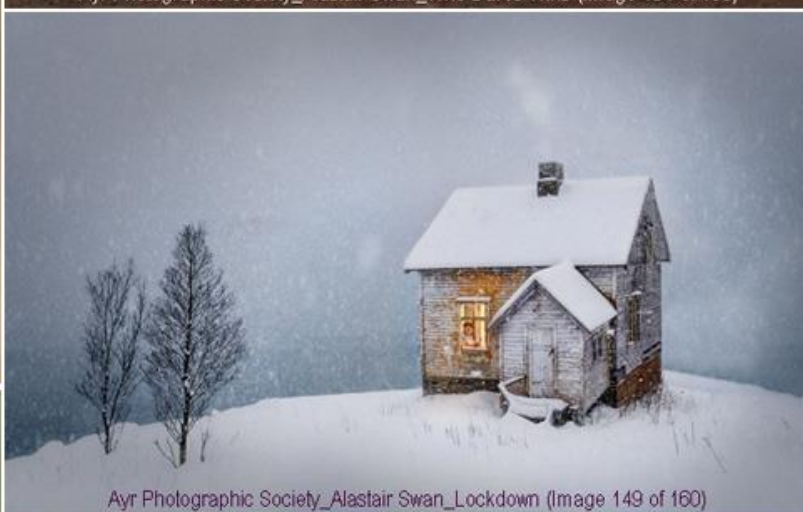
Ayr Photographic Society_Alastair Swan_Lockdown (Image 149 of 160)