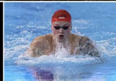
Annie's Dancer Shady Island For Good (Image 15 of 160)