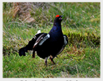
Black Grouse Hide

(Sales - Tuition - Hide Hire - Photography Tours)