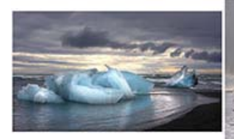
10_DP1169_Blue loe jpg