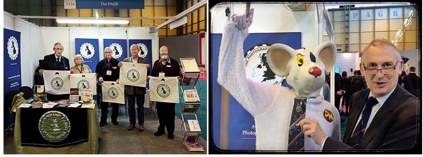
The PAGB team ready for action with designer carrier bags

Many other people dropped by who were interested in finding a club and hopefully your Club might have had a referral for membership. Please let e-news know if anyone turns up. Watch out for a full report in the next issue.