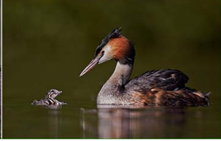
"Nature Photographer of the Year" is awarded to the entrant with the 3 highest scoring pictures in the GB Cup for Nature