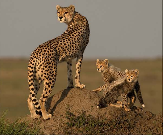
lan Whiston_Cheetah watching over cubs