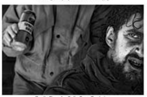
Devils Brew by Colin Trow Poole.jpg