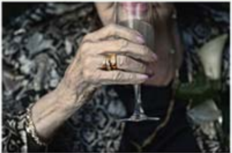
Evalat 90