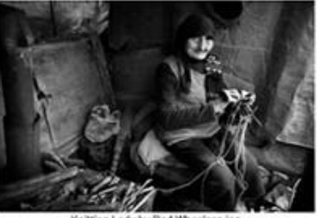
Knitting Lady by Rod Wheelans.jpg