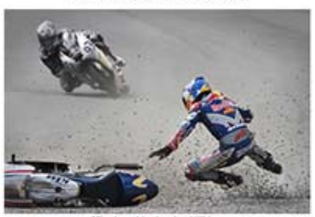
Misplaced by Louise Hill jpg