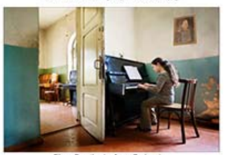
Plano Practice by Anne Greiner jpg