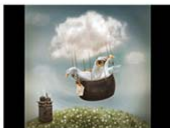
WIG33_Lynne Morris_The Great Escape.jpg