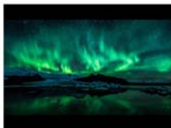
WIG19_Damian Black_Icelandic Aurora Over Fjallsarlon.jpg