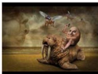
WIG21_Lynne Morris_I am the Walrus.jpg