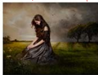
WIG10_KT Allen_Missing You.jpg