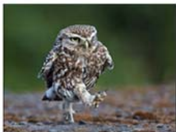
WIG11_Austin Thomas_Little Owl Walking.jpg