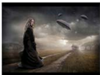
WIG17_KT Allen_Shelter Me.jpg