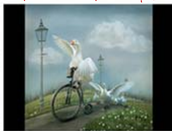
WIG2_Lynne Morris_A Wild Goose Chase.jpg