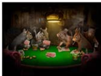
WIG27_Phil Barber_Playing for Nuts.jpg