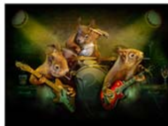
WIG29_Phil Barber_Squirrel Rock.jpg