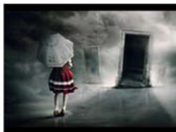
WIG12_KT Allen_No Coming Back.jpg