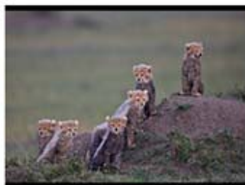
WIG13_Austin Thomas_Six Cheetah Cubs Looking Out.jpg