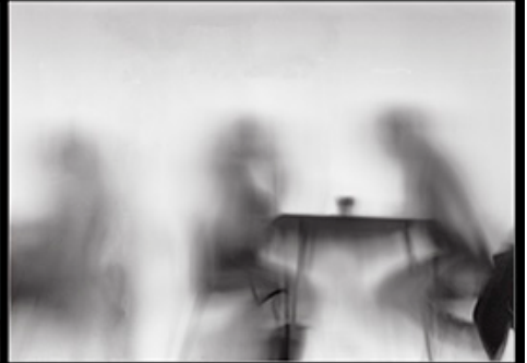
Fran Walding - Shadowlands