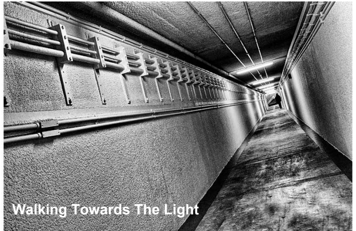
Walking Towards The Light