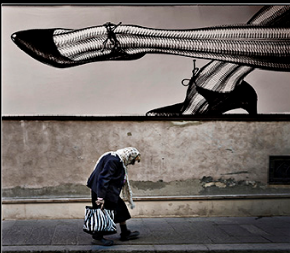
Goldin Leonid - Fashionable shoes