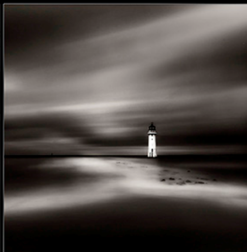
Les Forester - Defender