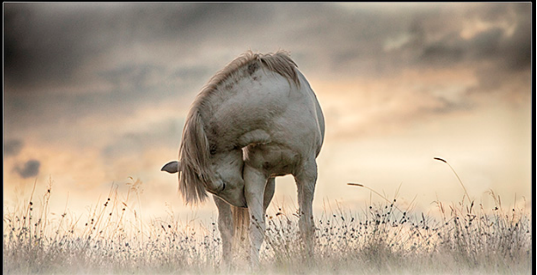
Ralph Duckett - Golden Beauty