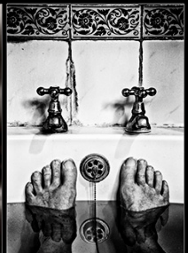
Laurie Turner - Soaking