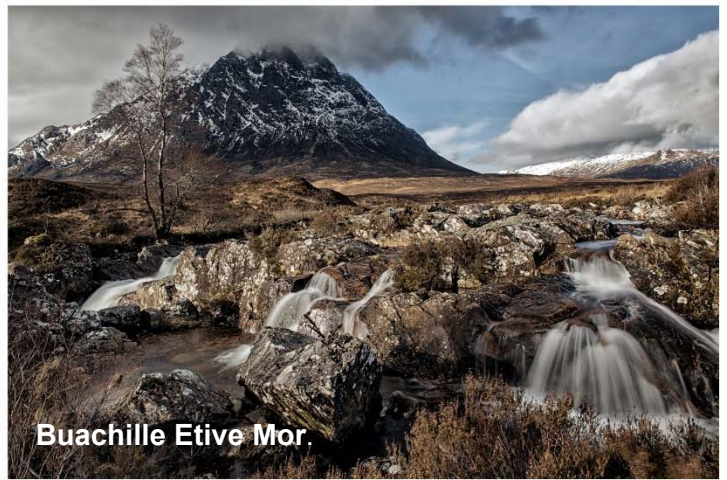
Buachille Etive Mor.