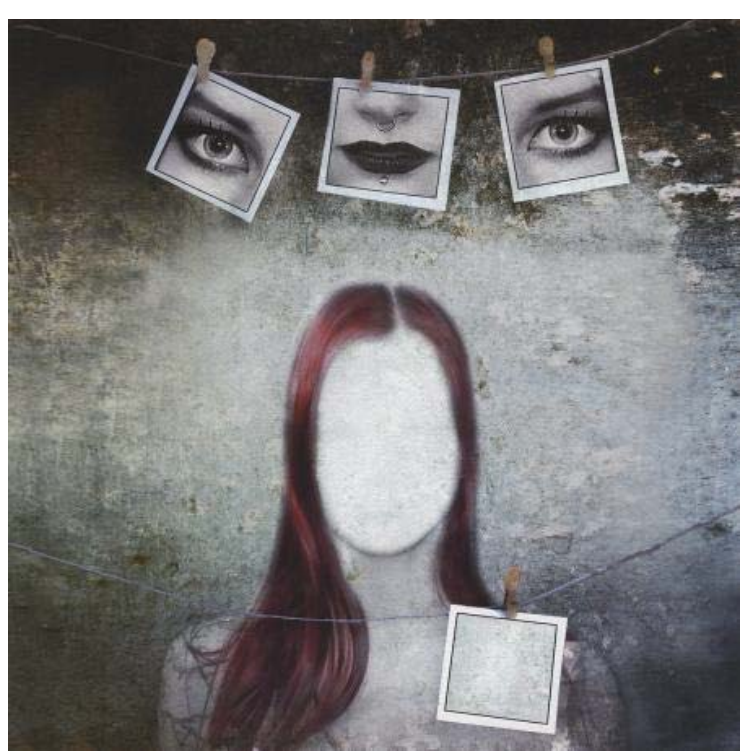
Captured Soul by Rikki O'Neil, Scotland