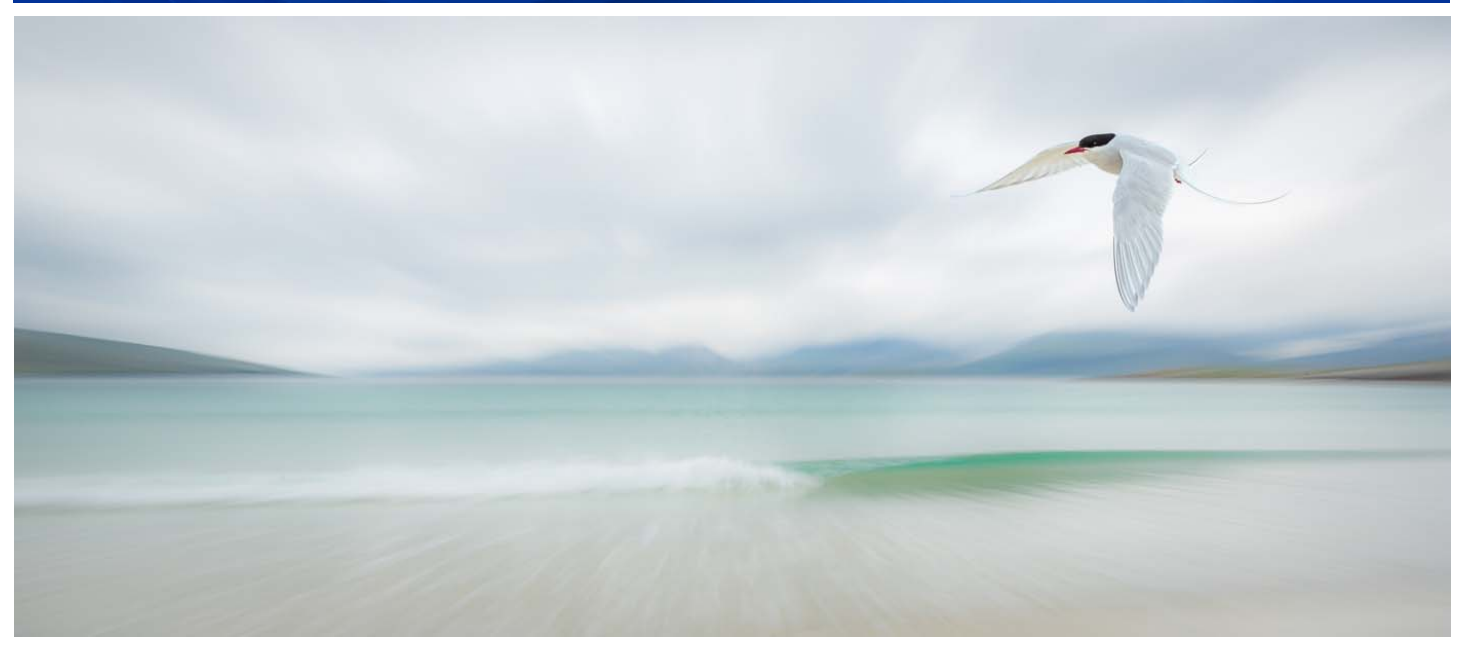
Arctic Tern over Luskentyre

MIDSUMMER DAY. Astronomically, midsummer is the day of the summer solstice, the longest day, which usually falls on June 20 or 21. The last time it did not fall on either of those dates was in 1975 when it was June 22. However, we recognise 24 June as Midsummer Day because the date was set when the Julian calendar was in operation, and it was wrong by a few days.