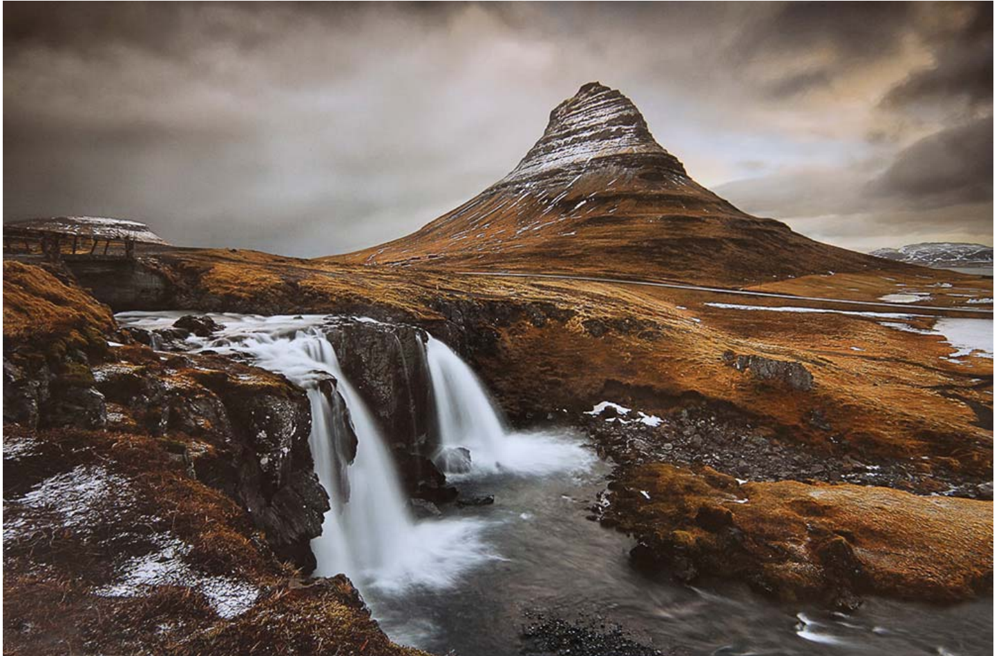
GB Trophy – Best Landscape. Kirkjufell Waterfall by Gregory McStaw, Catchlight CC