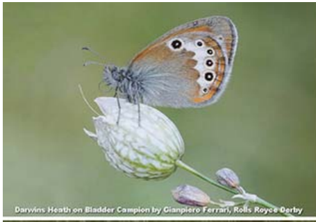
Darwins Heath on Bladder Campion