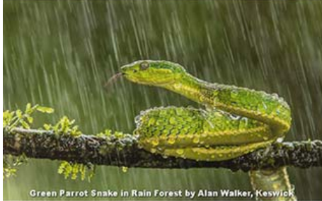
Green Parrot Snake in Rain Forest by Alan Walker, Keswick