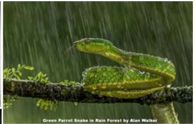
Green Parrot Snake in Rain Forest by Alan Walker