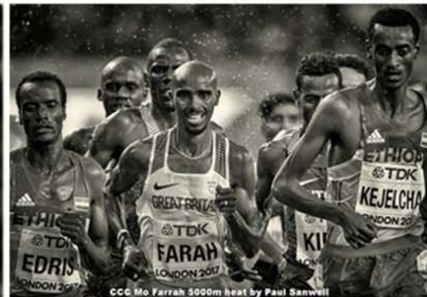
CCC Mo Farrah 5000m heat

Photographs from the Cambridge C.C. Winning entry