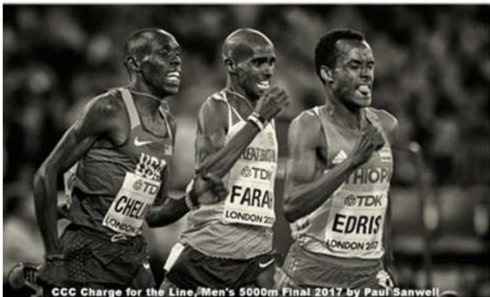
CCC Charge for the Line, Men's 5000m Final 2017 by Paul Sanwell