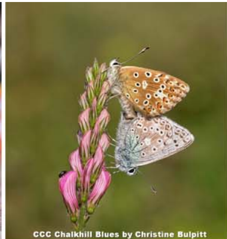
CCC Chalkhill Blues