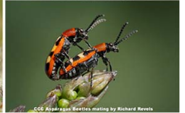
CCC Asparagus Beetles mating

More pictures from the Cambridge C.C. Winning entry.