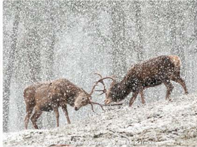
CCC Red Deer Sparring