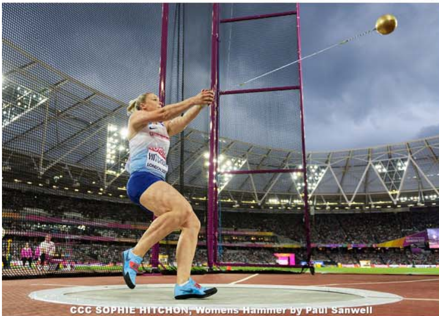
CCC SOPHIE HITCHON, Womens Hammer