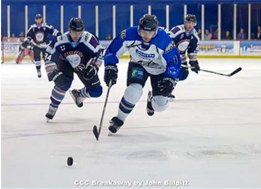
CCC Breakaway