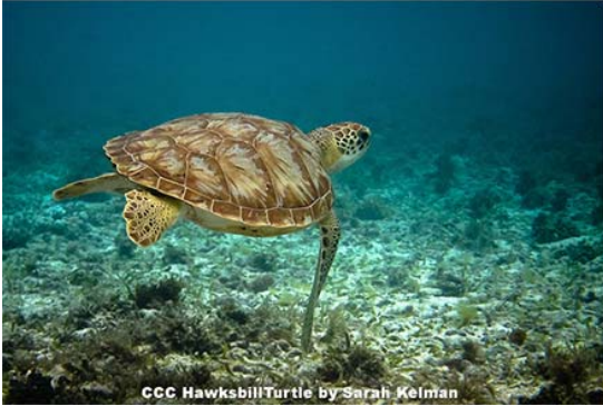
CCC Hawksbill Turtle