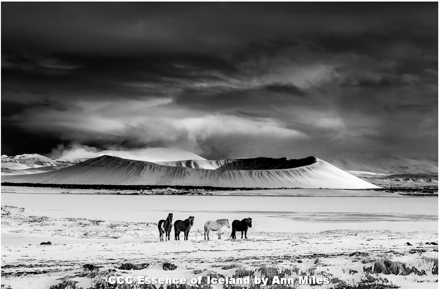
CCC Essence of Iceland by Ann Miles