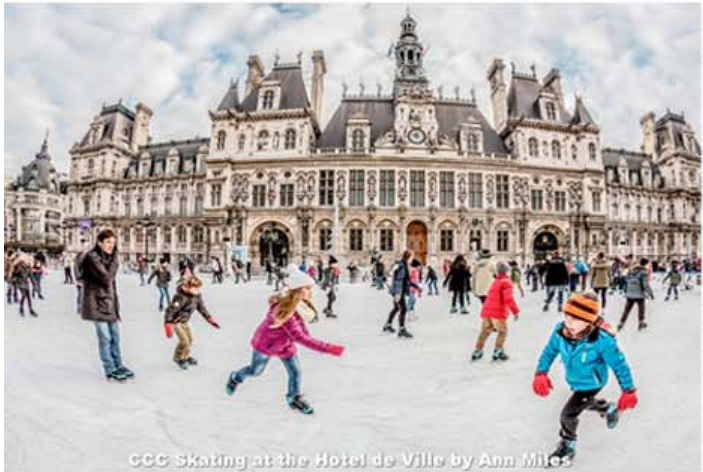
CCC Skating at the Hotel de Ville by Ann Miles