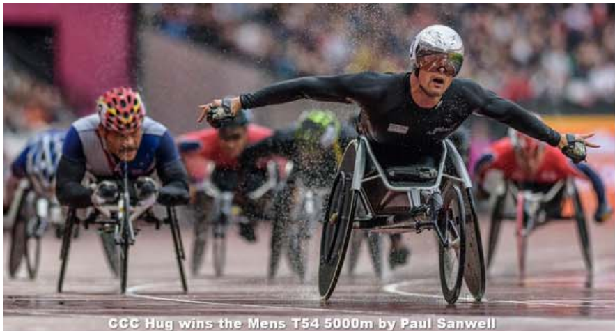
CCC Hug wins the Mens T54 5000m