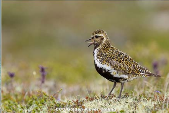
CCC Golden Plover Calling