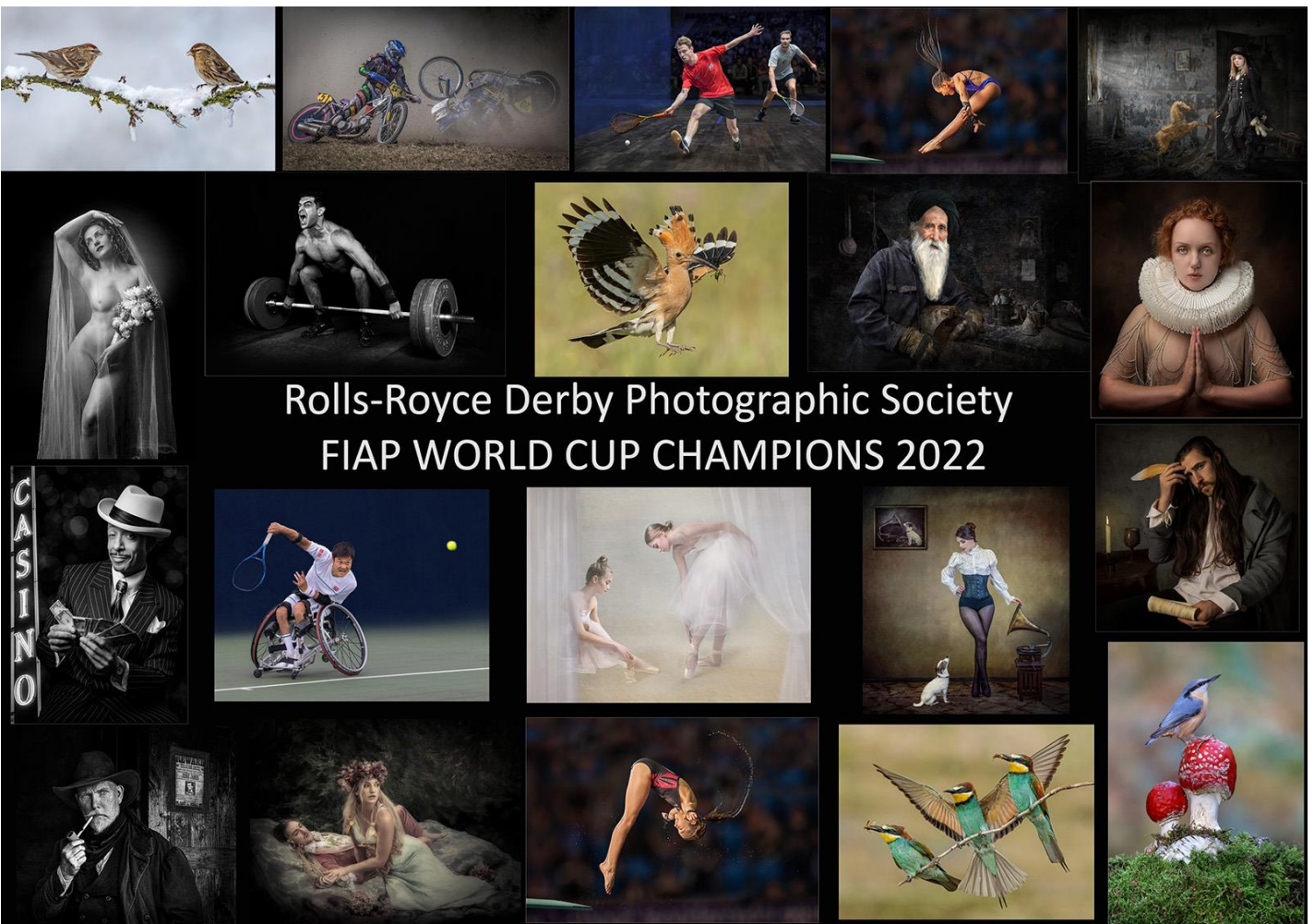
Rolls-Royce Derby Photographic Society FIAP WORLD CUP CHAMPIONS 2022

https://www.fiap.net/en/world-cups/17th-fiap-world-cup-for-clubs-2022