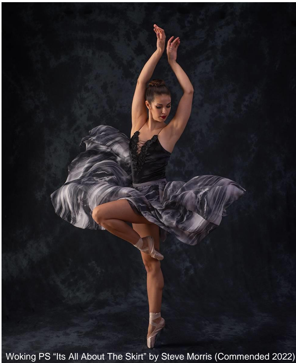
Woking PS "Its All About The Skirt" by Steve Morris (Commended 2022)

The GB Trophy Print total is a little disappointing but will still make a healthy competition. It is a little surprising that only 14 eligible Clubs have taken the opportunity to enter the "restricted" GB Cup competition and have chosen instead to try their luck against the more successful Clubs. Around 900 Clubs have found themselves unable to enter any of the competitions.