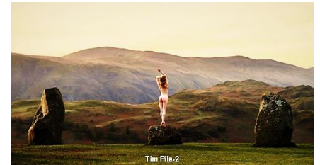
Image 4 was taken at the popular Dinorwic quarry, overlooking the Snowdonia mountain range.

The next image (3) was also taken at Two Wei, using the archway of one of their many lovely bathrooms.