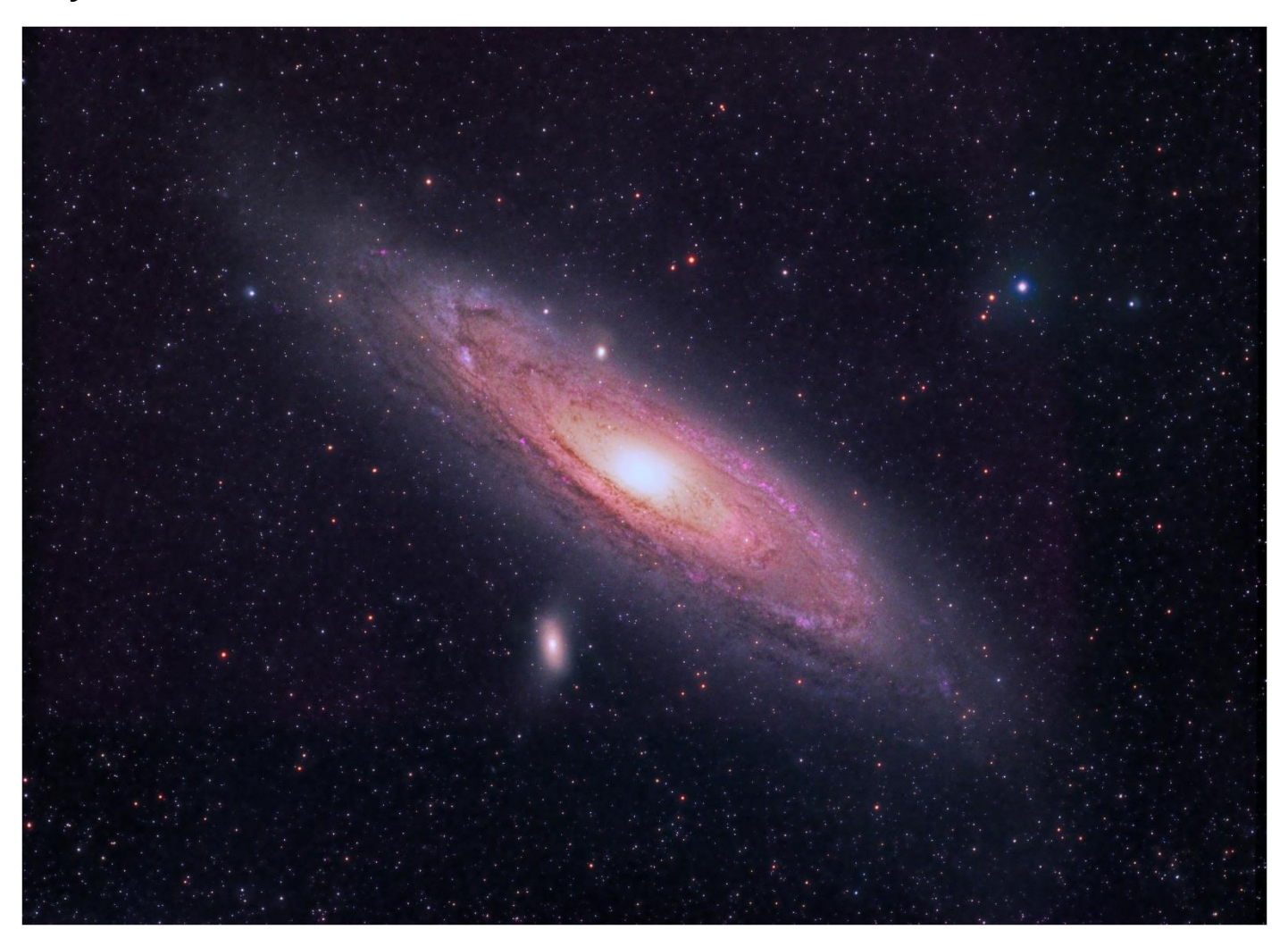
Andromeda. Our nearest neighbour.

I am hoping that this will be a longer term project aimed at broadening the range of photographs which are rewarded in Camera Clubs and in Regional and National Exhibitions. Perhaps one day, we may be able to gather together influential Judges and Judge's Secretaries from Federations to consider some of this work. There will certainly be an extensive e-news special issue and maybe even a Recorded Lecture.