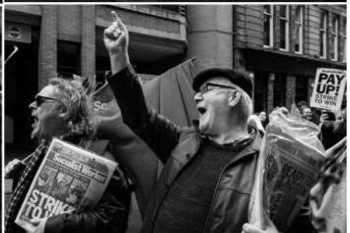
Worker's Protest.