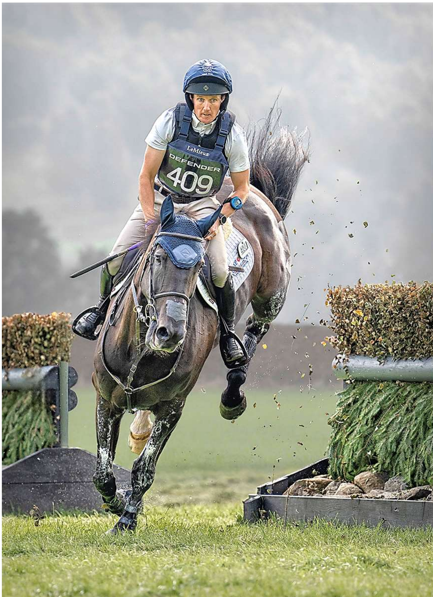
Defender 409