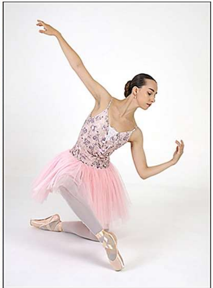
These are images by the 4 Applicants who were successful at BPAGB and will be featured, with images from all the CPAGB, DPAGB, EAGB and MPAGB Awards in a forthcoming e-news extra