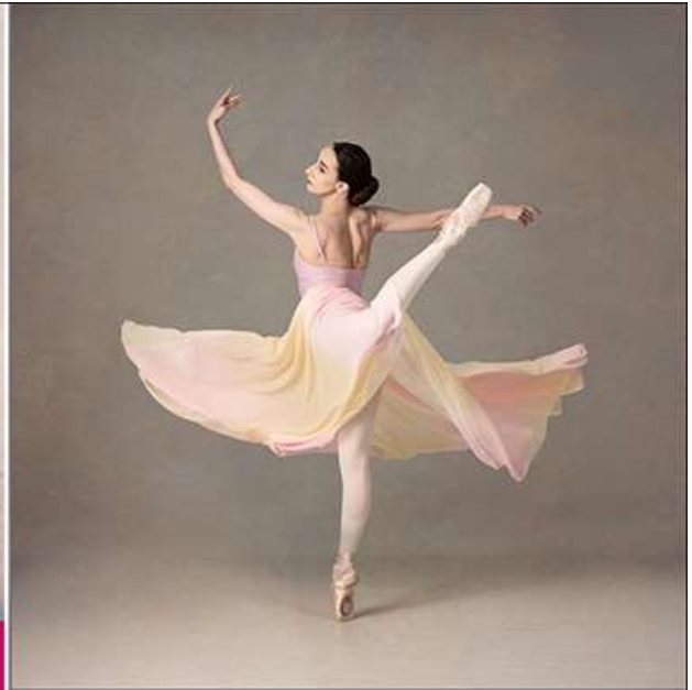
Lots to see including work like this by Derwood Pamphilon