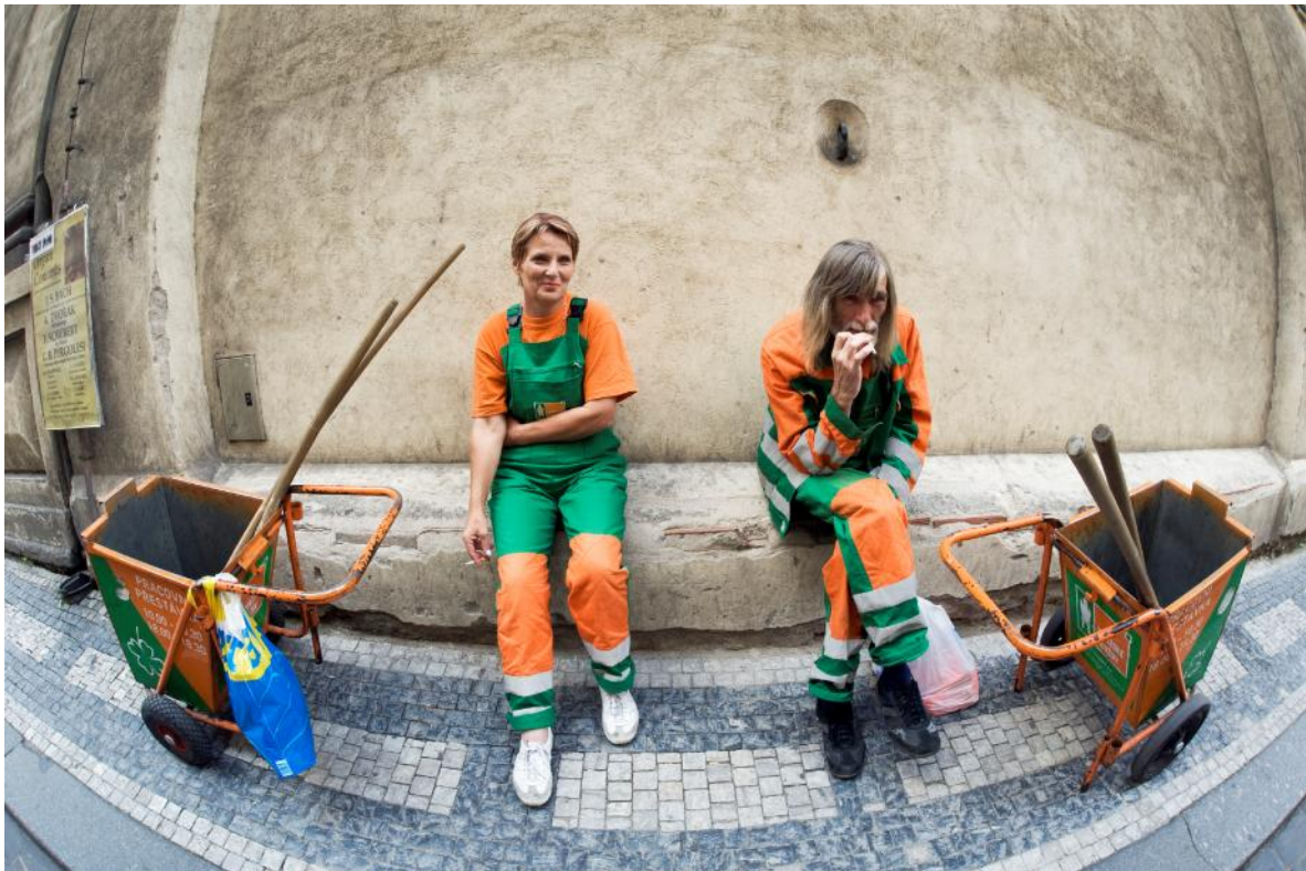
Street Cleaners, Prague

e-mail rod@creative-camera.co.uk and I'll send you a Dropbox link and instructions about size, format, etc. I may want some larger than 1400 px X 1050 px PDI size as there is the possibility of a book. Don't delay. Please do it NOW