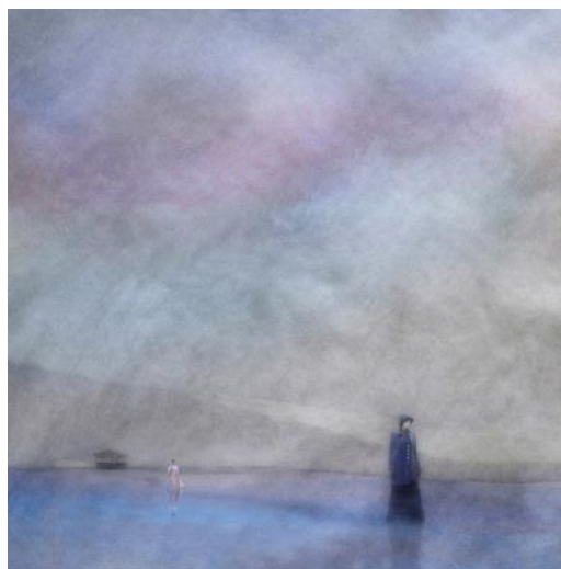
“Beach Walk” by Gwen Charnock Wigan 10, L&CPU