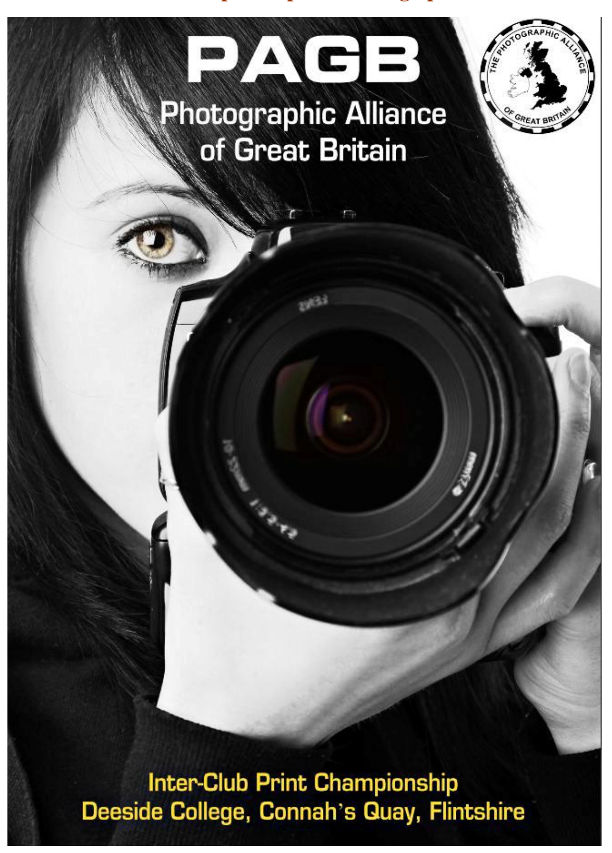
Issue 77 - Print Championship Advertising Special -Oct 2012