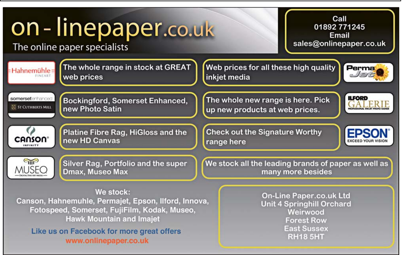
Page 10 e-news 93 Jun 2013